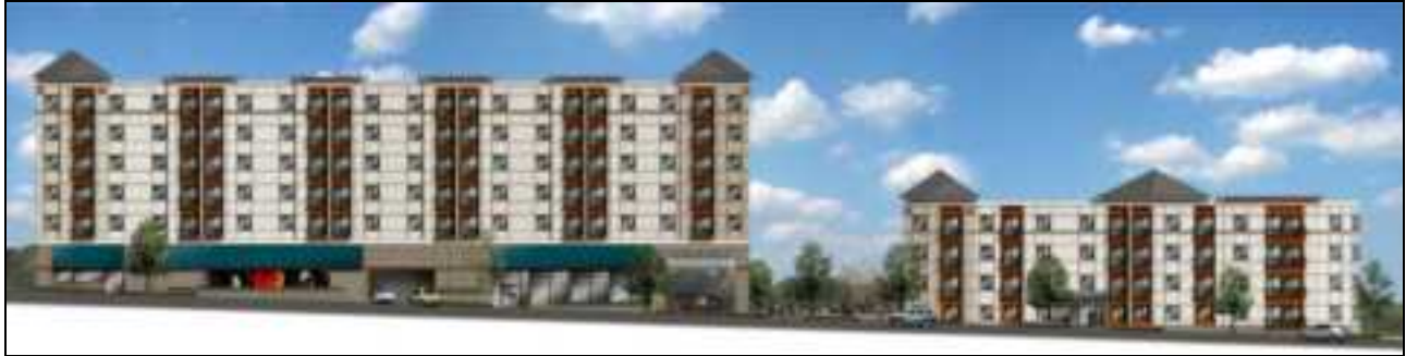
South elevation of 13 th Street depicting Building 1 and Building 2 of The Galaxy.

Parking consists of 160 spaces included within a new public parking garage under Building 1 that is accessed from 13 th Street and King Street. The public garage replaces the existing 57 surface parking spaces in the King Street Lot. In addition, a private parking garage with 274 spaces will accommodate parking for the residential and retail tenants of the Galaxy (subject site), and the residents of the Aurora (Site Plan No. 82004028A). The private parking is accessed exclusively from King Street.