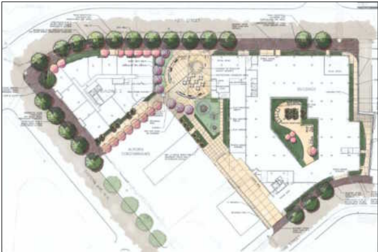
Site Plan of The Galaxy

Pursuant to the original Site Plan approval, the Applicant was entitled to develop the property with a maximum of 321 multi-family residential units (including 41 MPDUs) in three buildings up to 125 feet in height and an associated on-site parking structure containing a maximum of 200 public parking spaces and 449 private parking spaces. Due to current market conditions, the Applicant now seeks to modify these existing entitlements to allow the development of a 2.26 FAR mixed-use project that is smaller in scale and obtains a maximum height of 75 feet. The proposed project provides: a maximum of 241 multi-family residential units, including 31 MPDUs (12.5 percent) in two buildings; 3,663 square feet of street-level retail space; and a parking garage with 160 public parking spaces and 274 private parking spaces. Overall, there is a 25 percent reduction in the number of dwelling units proposed and only a 2 percent reduction in the public use space and amenity proposed with this Amendment.