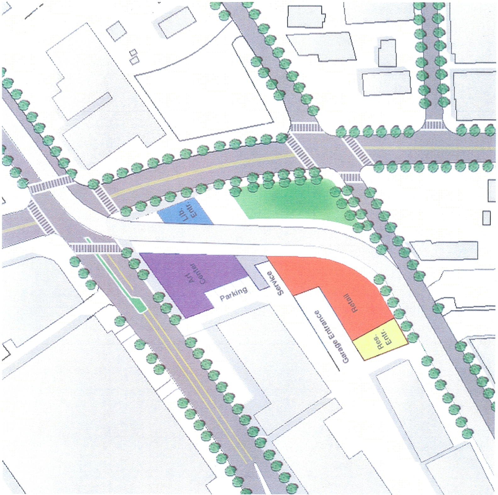
Plan of the Library