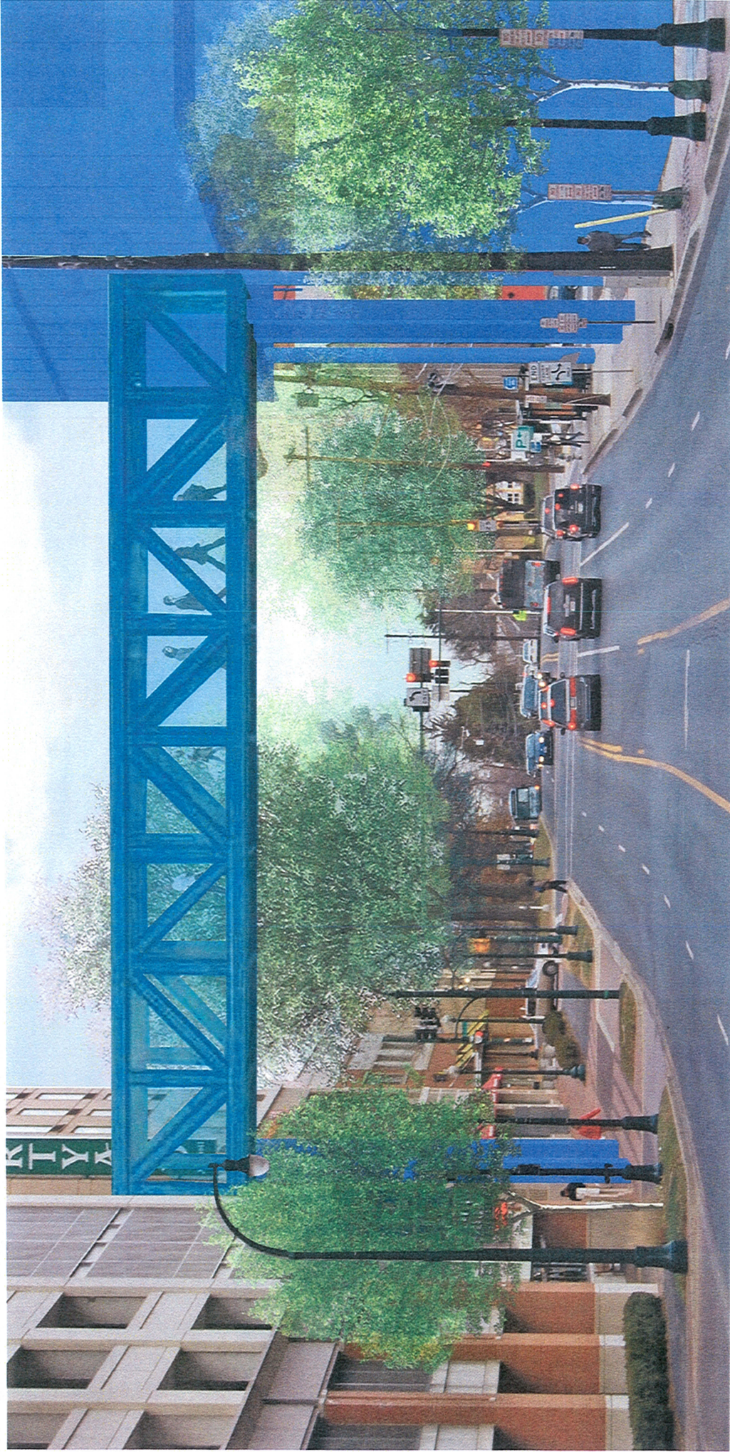
Pedestrian Bridge Alternative