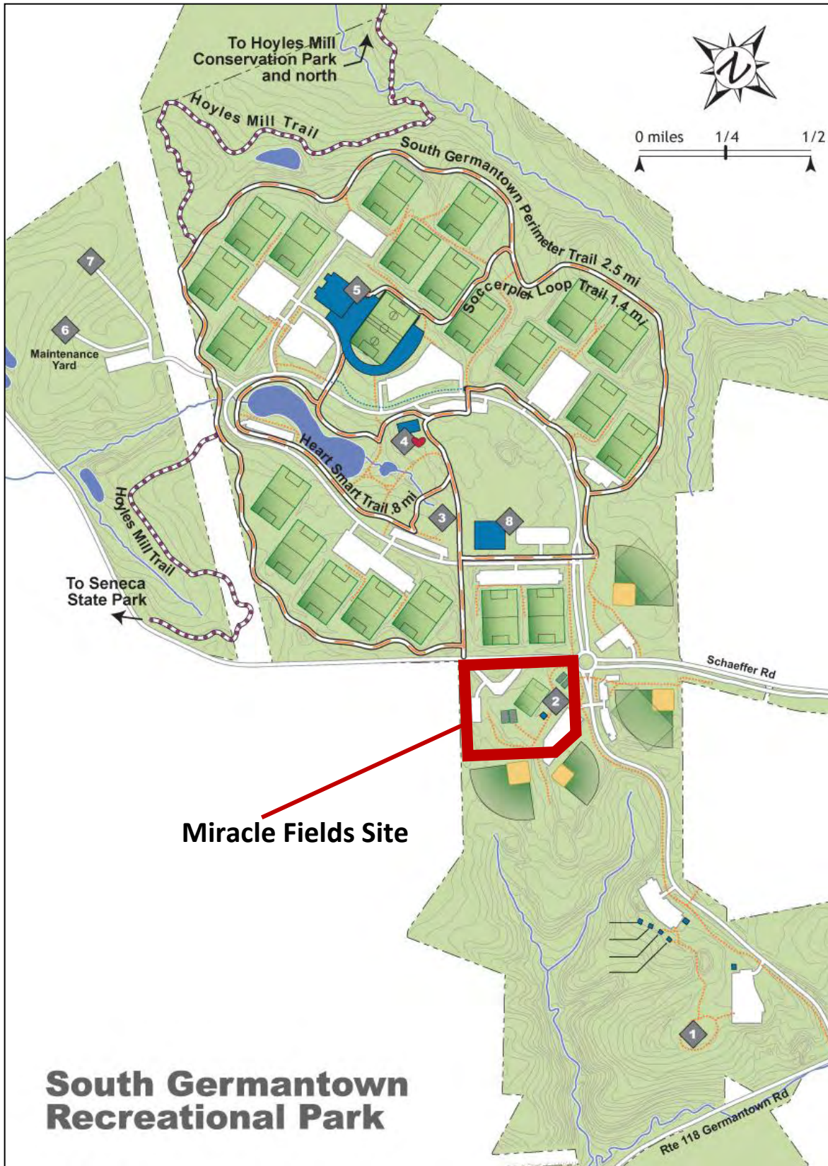
Figure 1: Miracle Field Site Location within South Germantown Recreational Park