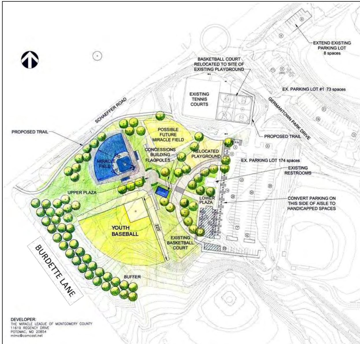
Figure 3: Miracle League Concept Plan