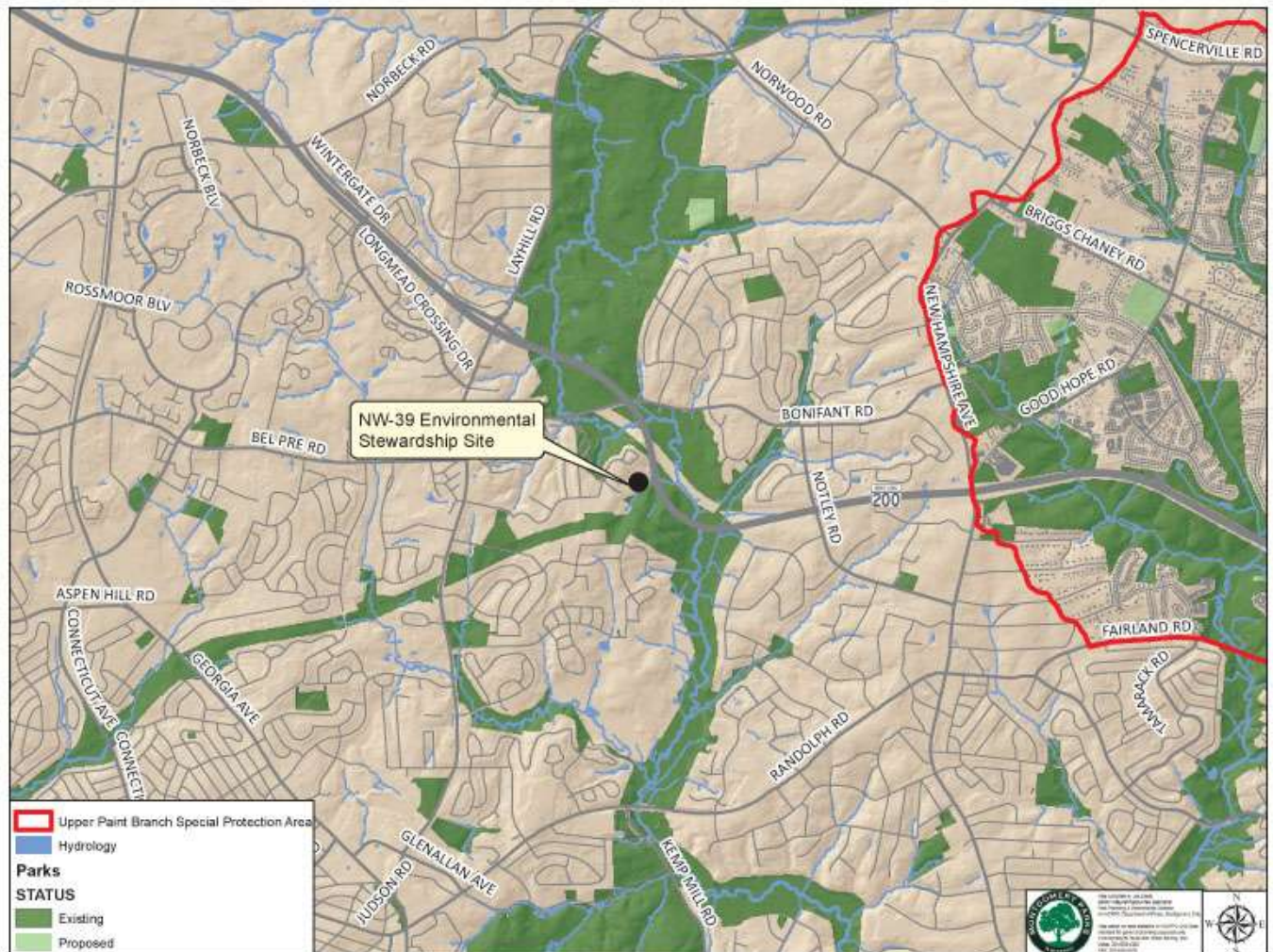
Figure 2. NW-39 Vicinity Map

The scope of stormwater management retrofit project NW-39 is to update the existing dry pond facility, originally constructed in 1982, to reduce downstream velocities and improve water quality. The pond is located in the Wheaton-Glenmont area of Montgomery County on Bonifant Woods Community Homeowner’s Association (HOA) Property. It drains into an unnamed tributary to Northwest Branch (Figure 2). The project site is bounded to the north by Long Green Drive and to the south by Alderton Lane.