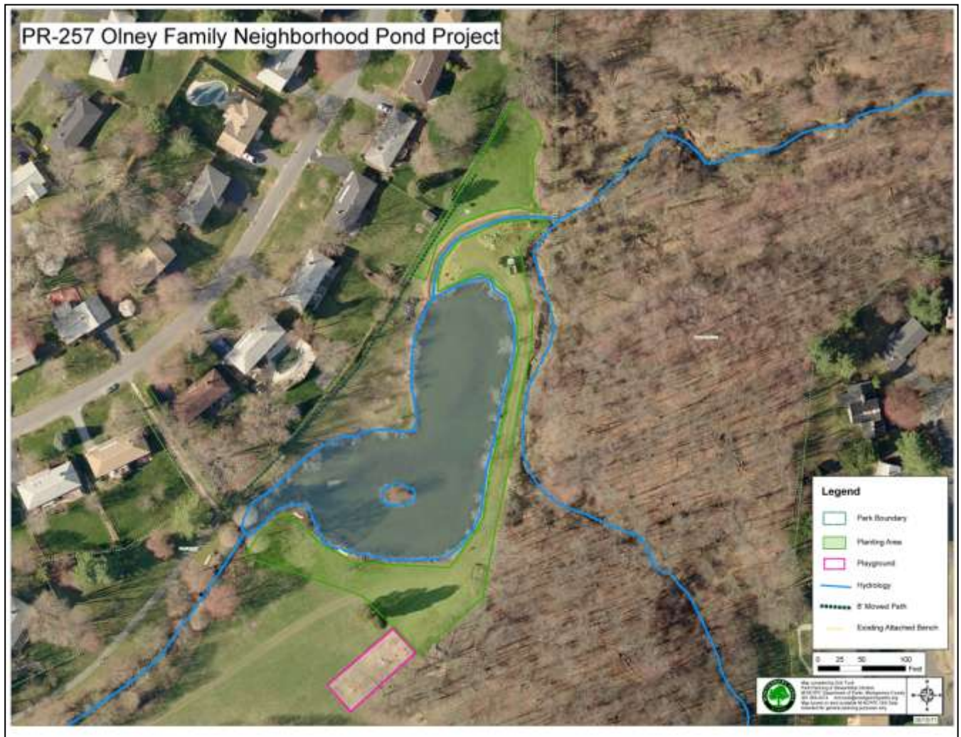
Figure 6. PR-257 Reforestation Proposal

In response to the design shown in Figure 6 that was presented to the OMCA HOA via email on September 17, 2011, OMCA has expressed their satisfaction with the latest proposal and has written a memo in support of the project (Attachment 1). Parks was also contacted by State Senator Zucker who has been following this project and submitted a letter supporting the latest proposal (Attachment 2). Delegate Zucker also acknowledged staff's efforts to achieve a workable compromise with the community.