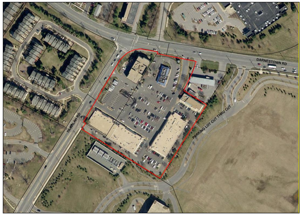
Site Aerial View