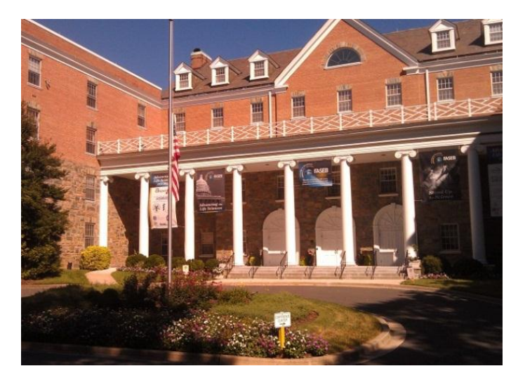
More than 300 people are employed in The Federation of American Society for Experimental Biology campus in Pooks Hill

The Pooks Hill community is served by a local park, the YMCA, and several places of worship that are all located within close commuting distance. These gathering places offer an opportunity for social activities and help create a sense of a community.