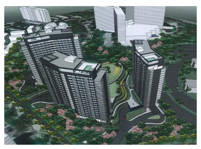
The applicant proposes to develop six acres of underused surface parking area with three high-rise residential buildings

high-rise (up to 20 stories) apartment buildings, totaling 780,500 square feet. This would include a number of moderately priced dwelling units (MPDUs). The Pooks Hill Minor Master Plan Amendment will assess the proposed multifamily residential development in the context of the broader community and will make recommendations to ensure that any redevelopment results in enhancing the Pooks Hill community.