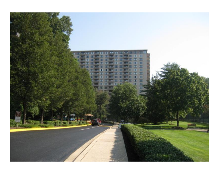
Promenade Towers is the largest residential community in Pooks Hill with approximately 1800 residents