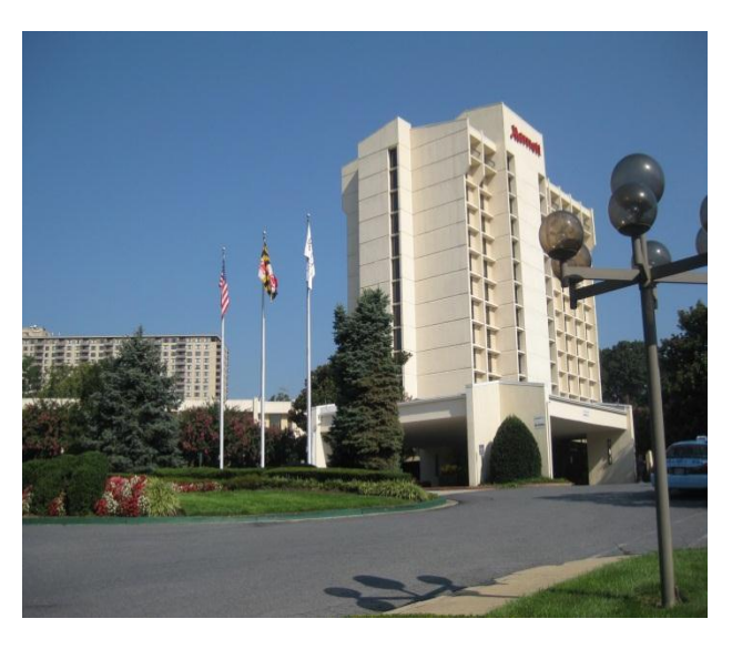
The 15-story Pooks Hill Marriott hotel has 407 guest rooms and was built in 1980

Montgomery County planners created a minor master plan amendment process to more quickly address potential land use changes and other priorities identified by community stakeholders. While master plans create a planning framework designed to last 15 to 20 years, minor master plan amendments are envisioned to be smaller and nimbler; addressing current and pressing planning issues. Minor master plan amendments will go through a similar public involvement process as other master and sector plans, including public meetings and opportunities to testify before the Planning Board.