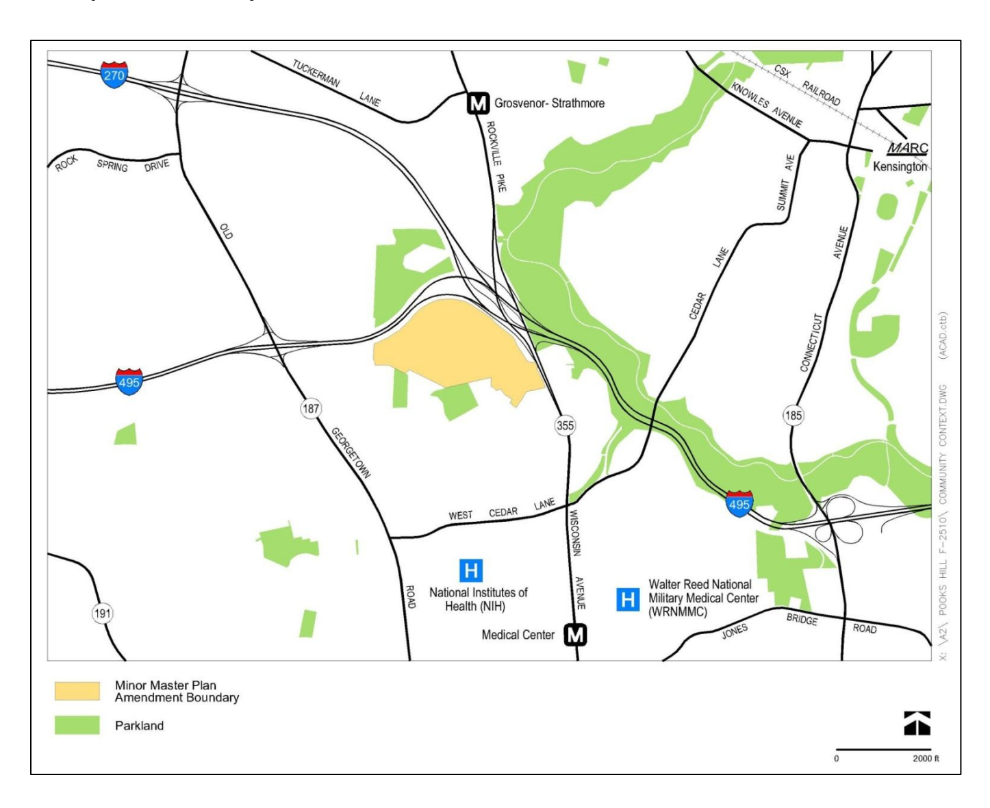
Map 1: Community Context