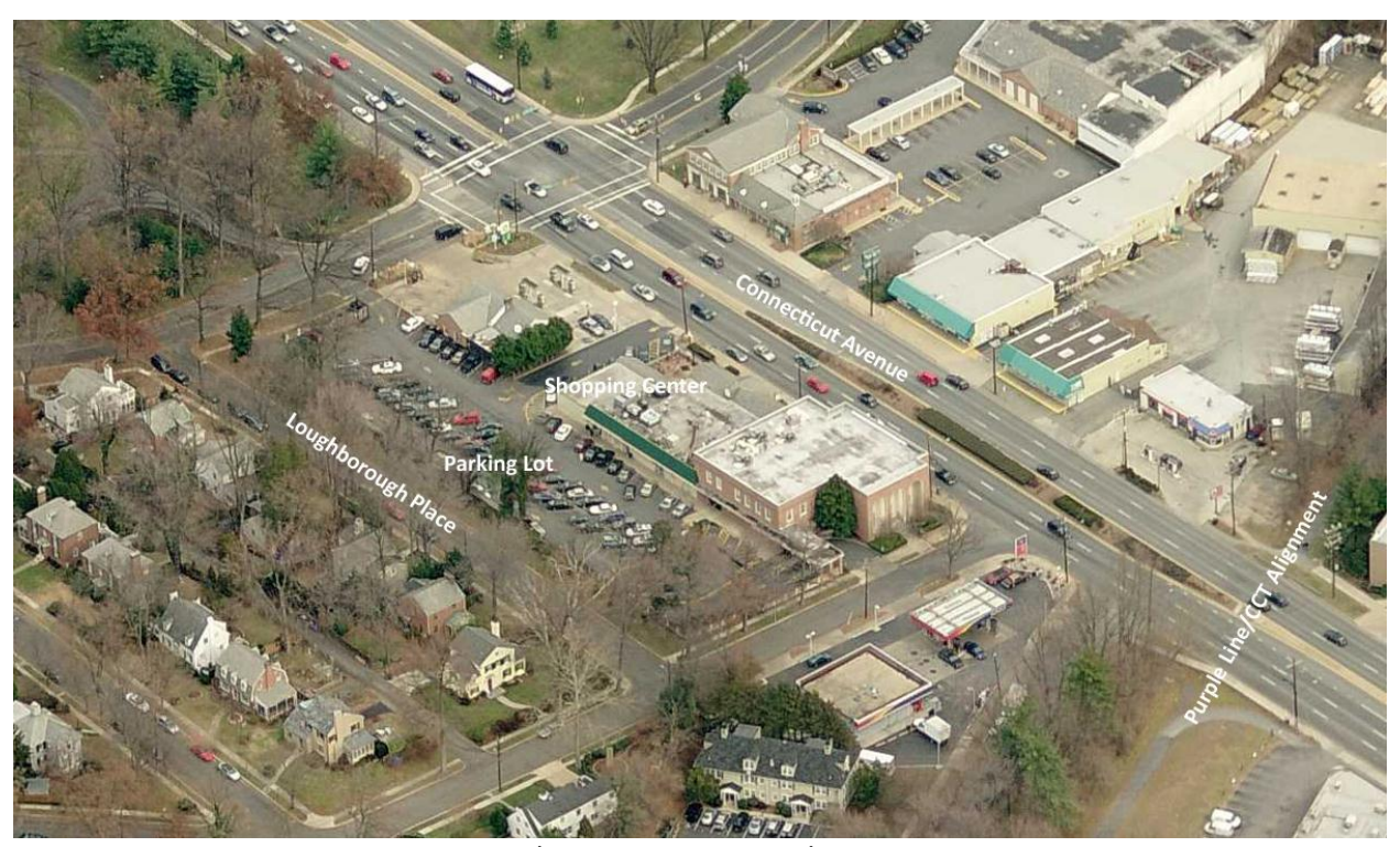
shopping center aerial view

In addition to testimony supporting the recommended building heights, the Connecticut Avenue Corridor Committee (CACC) supports a 70' building height north of Laird Place.