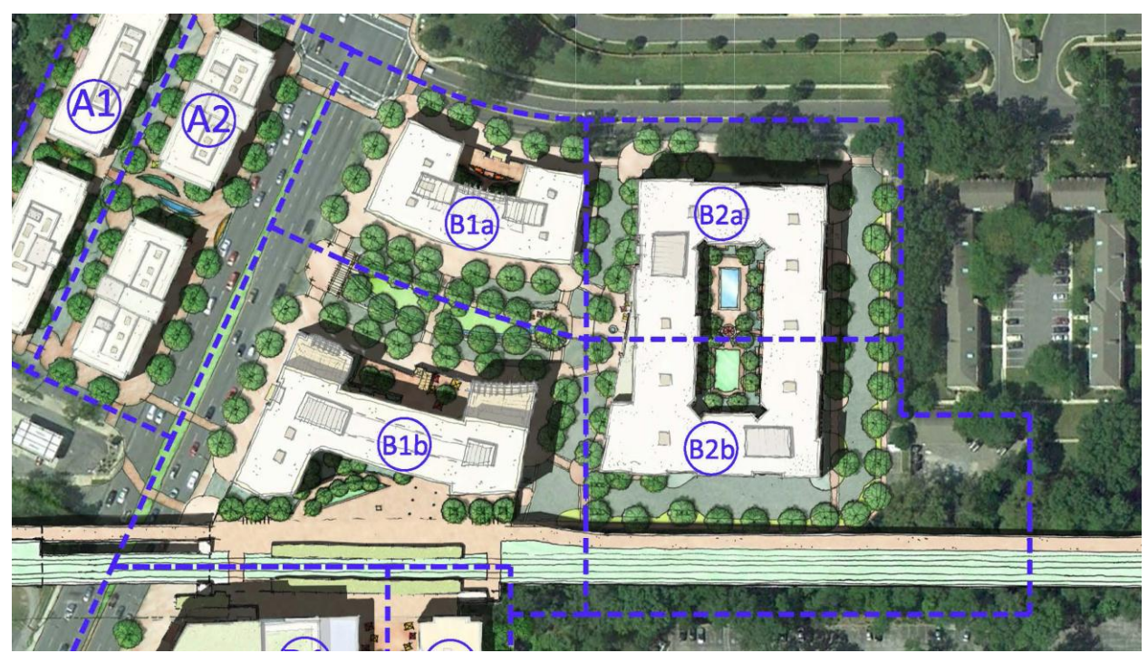
Land Company shopping center parcel map

Additionally, Bozzuto Development (no. 284) testified that building heights of 90'-120' are not economically practicable.