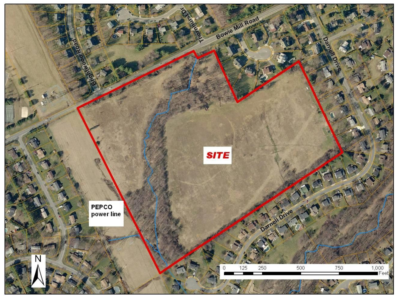
Aerial Photo with approximate site boundary outlined in red

The Subject Property consists of approximately 32.74 acres of unimproved land with 950 feet of frontage on Bowie Mill Road. The site is generally rectangular in shape, with a small notch in the northeast corner of the Property. There is a first order stream that flows from northeast to southwest through the Property, and there are approximately 1.20 acres of wetlands associated with the stream. Approximately 6.23 acres of the 6.79 acres of high priority forest on-site exists within the environmental buffer and is dominated by red maple and ash. A WSSC right-of-way also runs through the environmental buffer. The environmental buffer covers about 10.96 acres, or approximately one-third of the site.