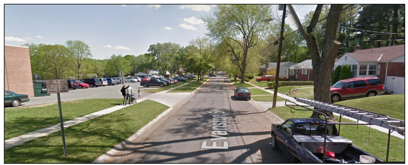
South facing view along Evanston Street