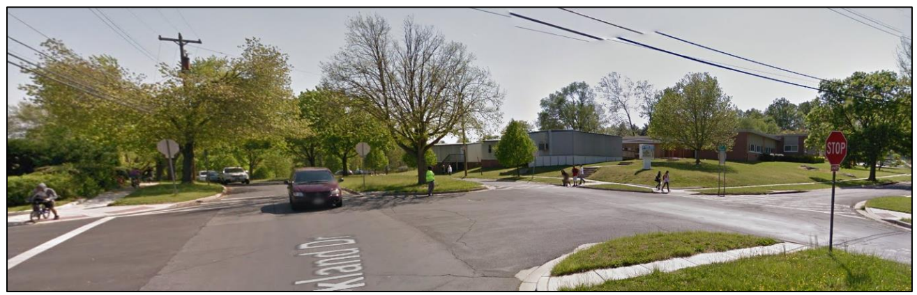
South facing view along Parkland Drive

Ride-On Route 48 operates along Parkland Drive with 30-minute headways between the Wheaton Metrorail Station and the Rockville Metrorail Station on weekdays and Saturdays. The nearest bus stop is located at the intersection of Parkland Drive and Falcon Street.