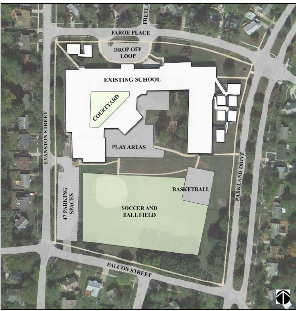
Subject Property Existing Conditions

Staff approved a Natural Resource Inventory/Forest Stand Delineation Plan (NRI/FSD) #420151340 on March 13, 2015. There are no known rare, threatened, or endangered species on site; there are no forests, 100-year floodplains, stream buffers, wetlands, or other environmentally sensitive features on site. The Subject Property is within the Lower Rock Creek watershed and has 50 trees of 24" or greater Diameter at Breast Height (DBH). There are no known historic properties or features on site.