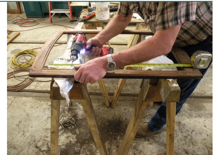
Final steps include re-glazing the end wall windows.