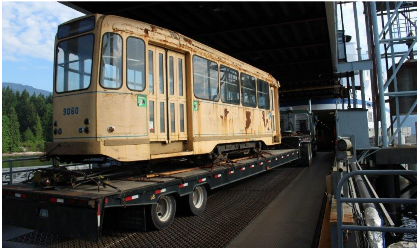
Silk Road Transport maneuvers onto the BC Ferry to cross Howe Sound, northwest of Vancouver, British Columbia, on May 21 st .