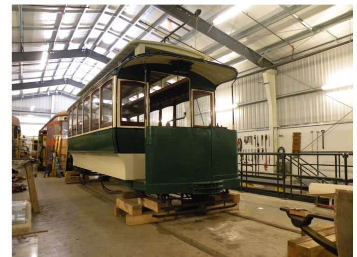
The windows are installed. The roof canvas and painting are complete. The trolley pole is ready to go. Now CTCO 522 awaits the delivery of a Lord Baltimore truck, installation of its portable vestibules and entrance steps, plus completion of lettering and striping.