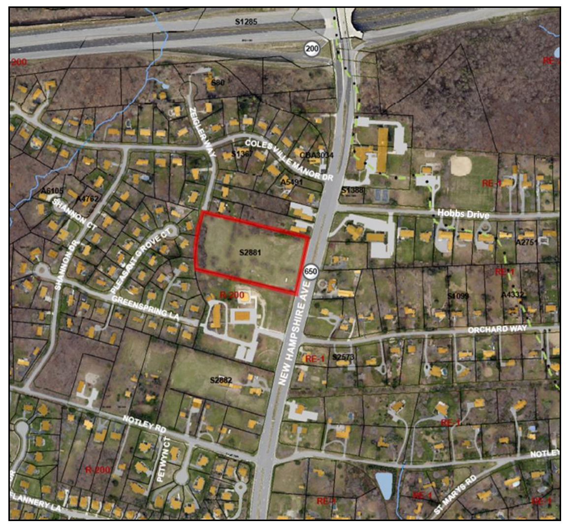
Figure 1 - Vicinity Map

The Property lies in both the Paint Branch watershed and Northwest Branch watershed, but outside any Special Protection Areas. There are no streams, wetlands, floodplains, or environmental buffers on the site. The Property will be served by public water and sewer.