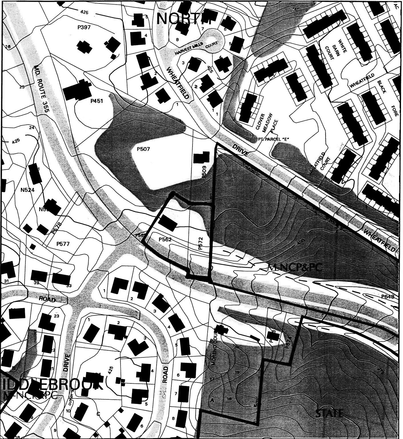
Map compiled on July 02, 2003 at 9:45 AM | Site located on base sheet no - 226NW11