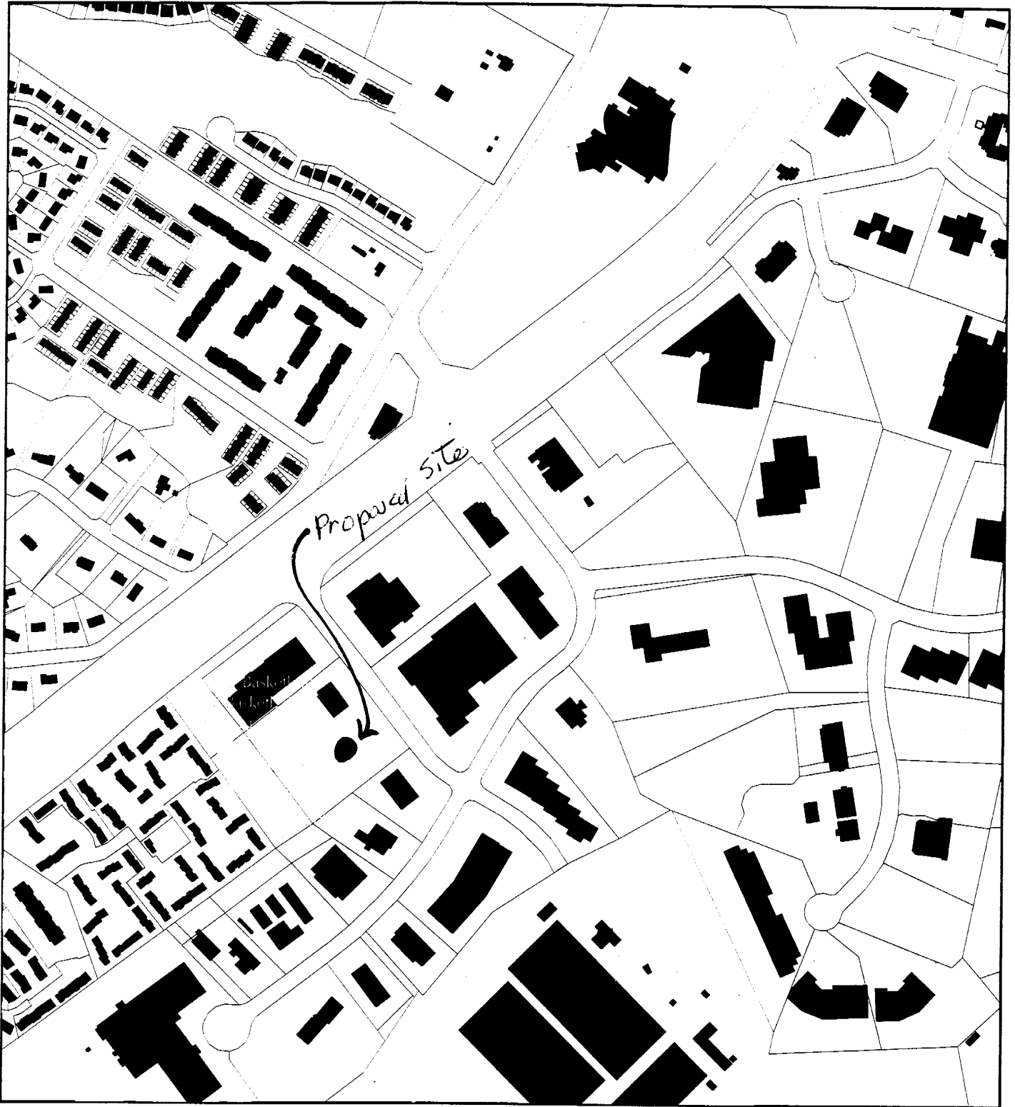
Map compiled on January 12, 2004 at 11:07 AM | Site located on base sheet no - 216NE02