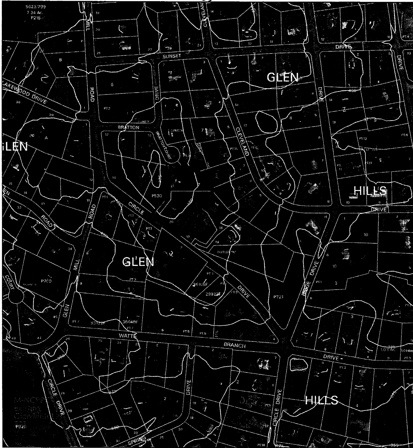
Map compiled on September 22, 2005 at 4:59 PM | Site located on base sheet no - 217NW10 | Date of Orthophotos - April 2004 | Orthophoto Images Licensed from VARGIS LLC.