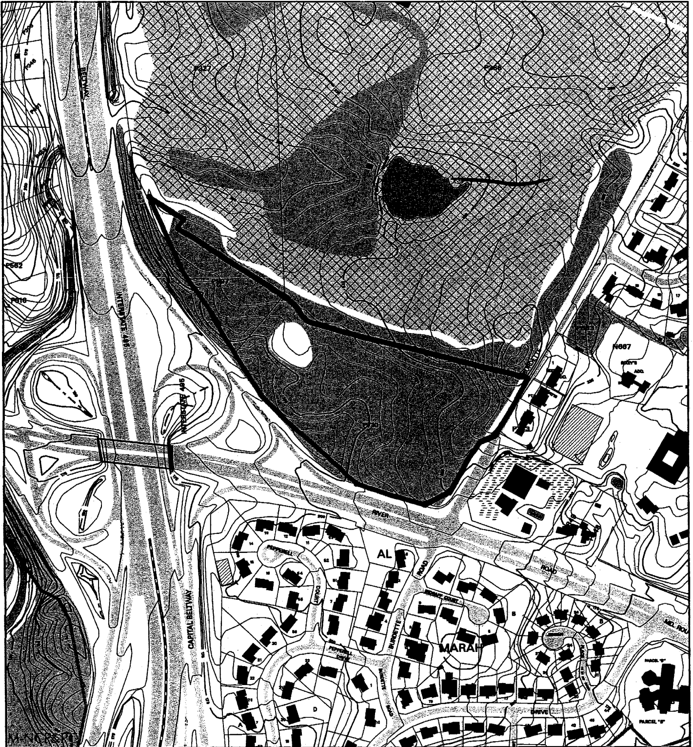
Map compiled on January 04, 2002 at 2:00 PM | Site located on base sheet no - 210NW07