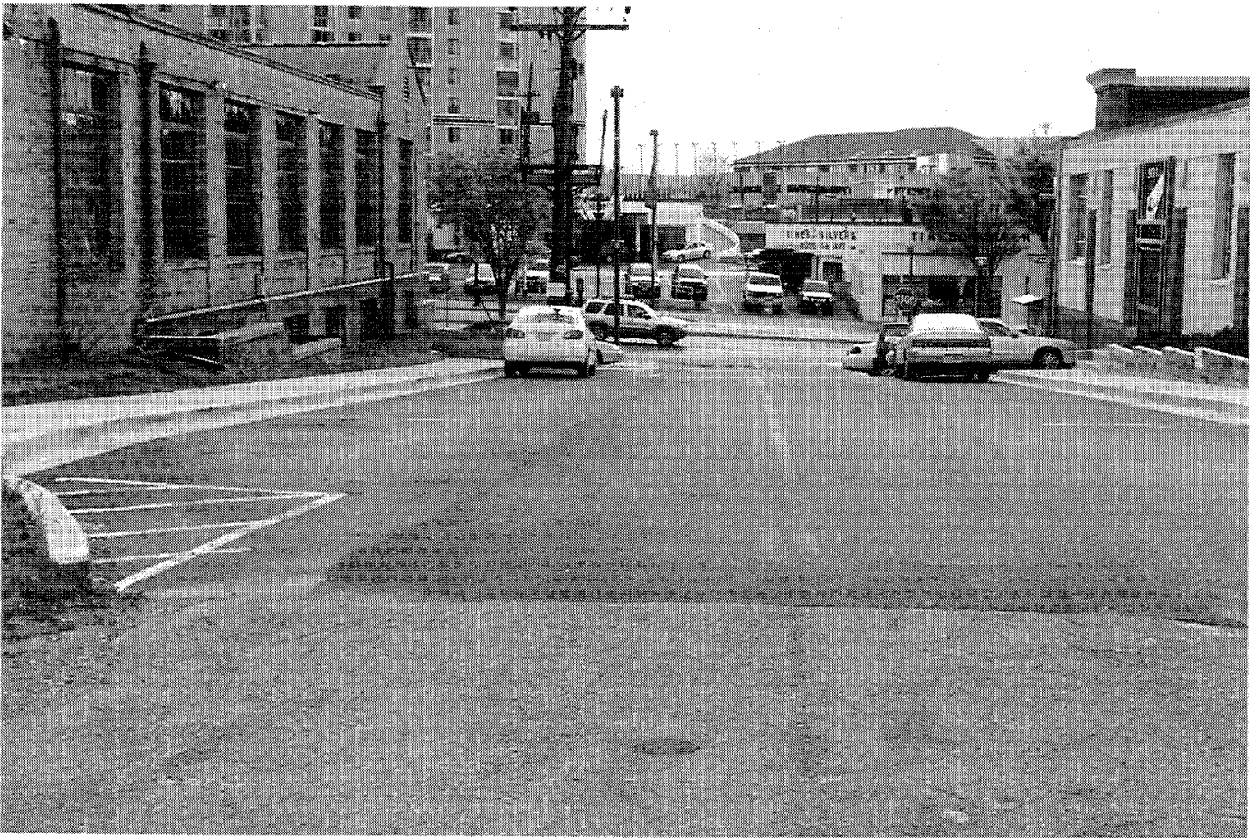
Photo 3. View eastbound on Stoddard Place towards Georgia Avenue

Stoddard Place will serve as the only point of vehicular access to the site, with provision for both resident and service vehicles. Staff requests that the applicant install sidewalks along the site frontage of Stoddard Place to allow for improved pedestrian access. As the dimensions of Stoddard Place do not meet the minimum standards for Business Streets or Primary Residential Streets, staff also asks that the applicant work with personnel from DPWT and from Fire and Rescue Services to ensure adequate provision for emergency vehicles.