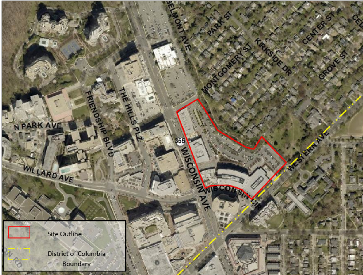
Figure 1 – Site Aerial

The Subject Property is located within the wedge formed by Wisconsin Avenue and Western Avenue, NW, north of Wisconsin Circle. The Western Avenue, NW, right-of-way forms the border between the State of Maryland and the District of Columbia. Adjacent to the site to the northeast is Chevy Chase Village. To the west, across Wisconsin Avenue, are higher-density commercial and residential buildings. The Friendship Heights Metro station is located at the intersection of Wisconsin Avenue and Western Avenue, with entrances on all four corners. The general context of this area consists of higher-density development along Wisconsin Avenue scaling down to one-family residential behind.