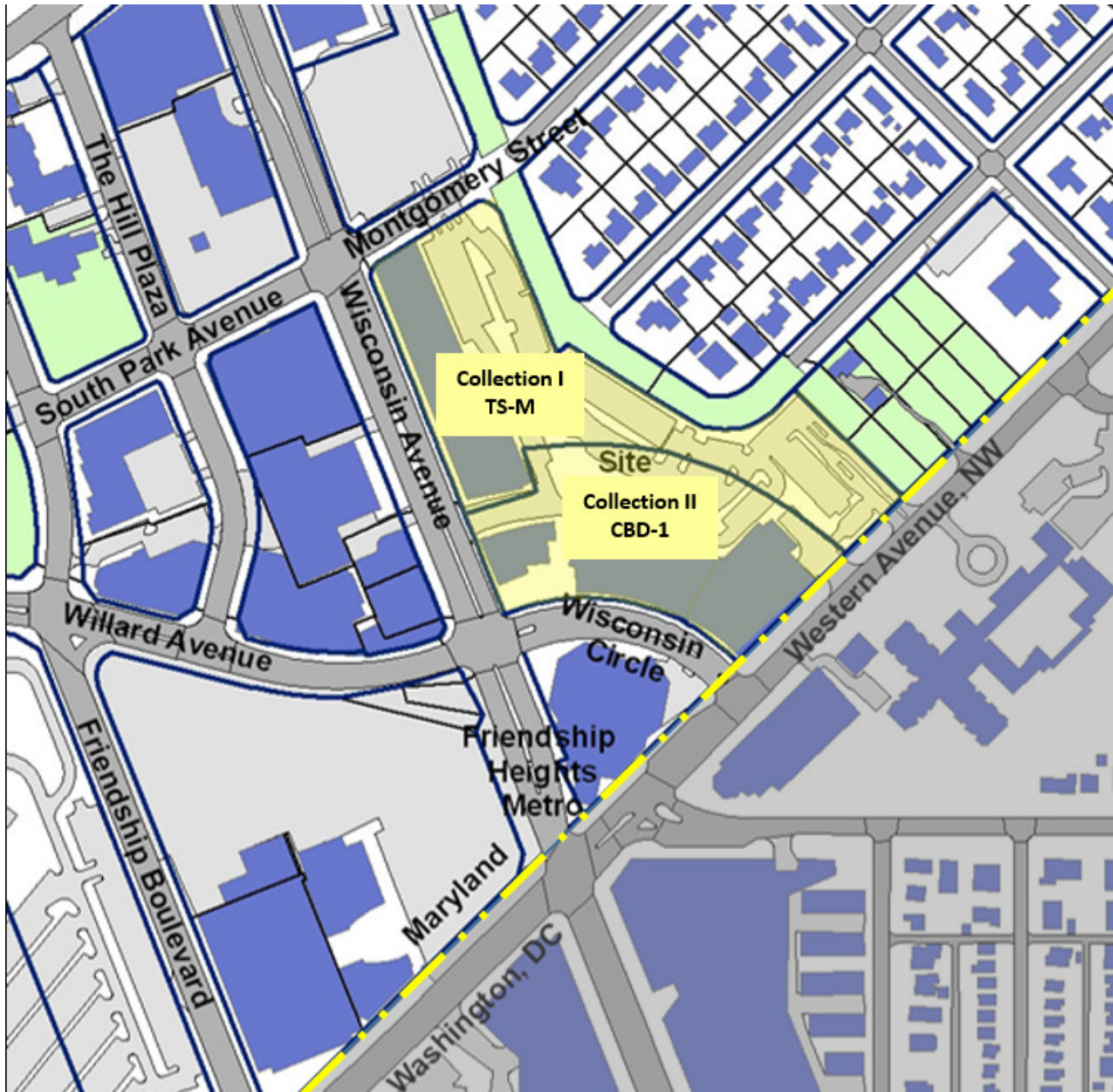
Figure 2-Vicinity Map

The subject site was split-zoned CBD-1 and TS-M 1 , with the Chevy Chase Neighborhood Retail Preservation Overlay Zone over the CBD-1 portion. The portion of the site currently referred to as The Collection I was zoned TS-M, while the portion referred to as The Collection II was zoned CBD-1. The combined Chevy Chase Center shopping center includes a supermarket, several restaurants, and high-end retail development. Each of the buildings fronts directly onto Wisconsin Avenue, Wisconsin Circle, or a private interior drive. Surface parking lots above underground structured parking are located behind the buildings and are themselves buffered from the adjacent single-family residential