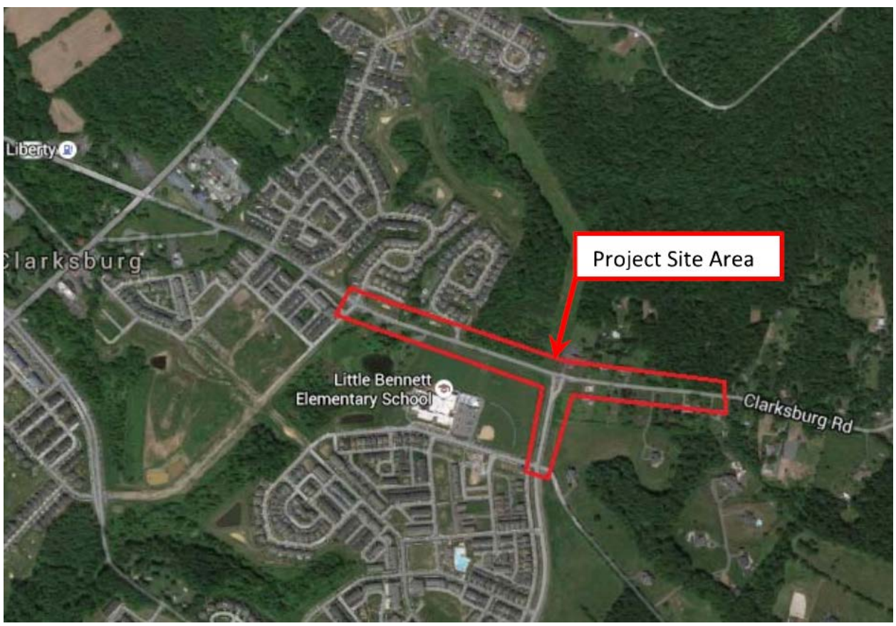
Figure 2. Project Location