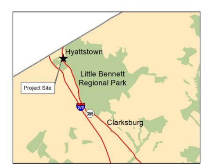
Figure 1. MD 355 Bridge Replacement over Little Bennett Creek Project Location Map

Little Bennett Regional Park east of MD 355 is part of the Little Bennett Best Natural Area, classified as one of the Park system's best quality and most unique ecological communities. Little Bennett Creek is a Use III-P stream (Nontidal Cold Water and Public Water Supply), which supports one of the few brown trout fisheries in the County.