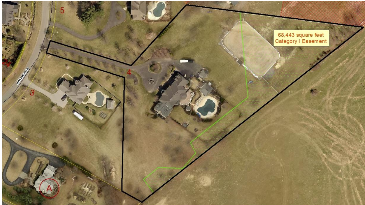
Exhibit 2: 21533 Ripplemead Drive Conservation Easements with 2015 Aerial Photo Overlay