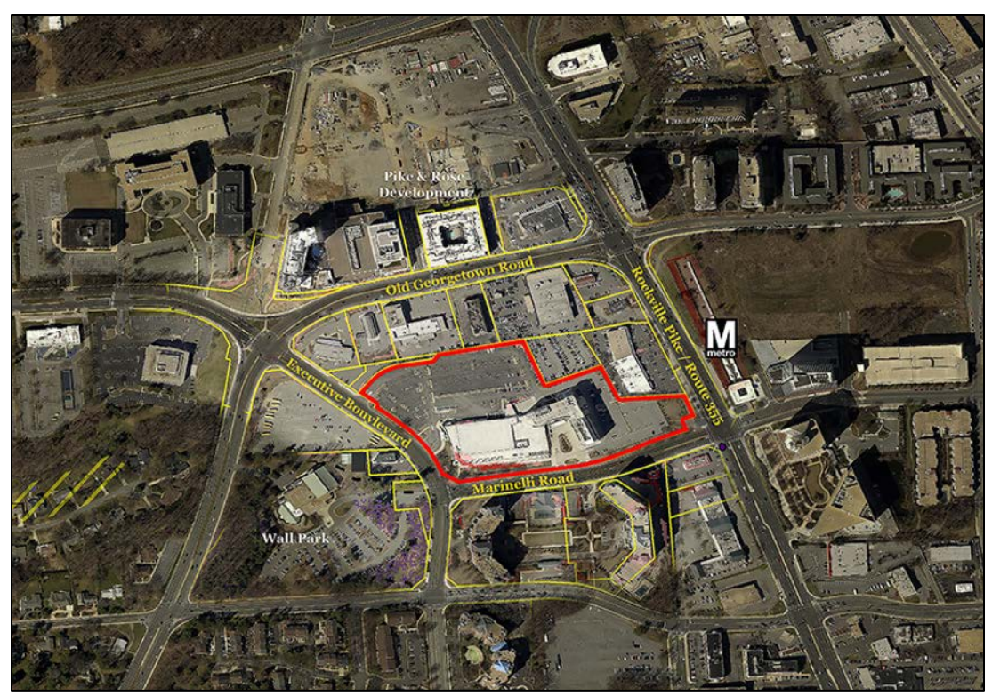
Figure 1: Hotel and Conference Center (outlined in red) and existing road network