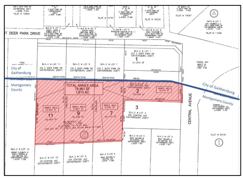
Figure 2- Annexation Property Boundaries

The Applicant is petitioning the City of Gaithersburg to annex lots 2, 7, 9 and 11 in Block 2 of the Oakmont Subdivision, Plat Book A Plat Number 20 (see Figure 2). The area of annexation consists of the portions of the four platted parcels that are currently not within the boundaries of the City of Gaithersburg. The proposed annexation intends to place these four lots that are currently within the two jurisdictions into one locality, within the City of Gaithersburg.