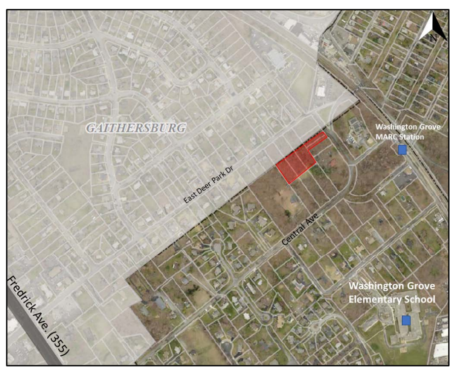
Figure 1- Vicinity Map

MB Becraft LLC (the "Applicant" or "Petitioner") is the owner of the area proposed for annexation, which is located at the intersection of Central Avenue and East Deer Park Drive and includes lots 2, 7, 9 and 11 in Block 2 (Property). The Property is approximately one-half mile east of South Fredrick Avenue, as shown in the area outlined in red in Figure 1. To the east is the Washington Grove MARC Station; to the south is Washington Grove Elementary School; and to the north is the Gaithersburg City limits. The Property is zoned R-200 and is in the 2010 Great Seneca Science Corridor Master Plan area. The Property is in a neighborhood comprised of single-family detached houses. The surrounding zoning is R-200 and R-90 as shown in Figure 3.