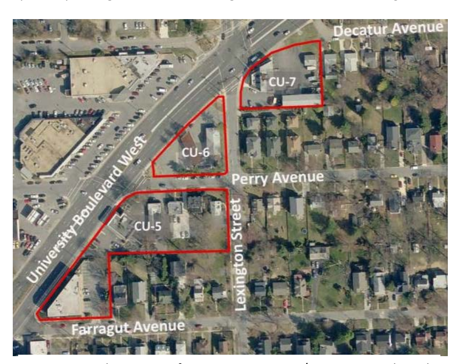
Figure 2: Analysis Areas of Connecticut Avenue/University Boulevard (CU-6 and CU-7) in the 2012 Kensington Sector Plan .

The CU-6 property located at 3700 University Boulevard West is zoned CRN 1.0: C1.0, R0.5, H-45. The four CU-7 lots located at 3606-3610 Decatur Avenue and 3610 University Boulevard West, at the southeast intersection of Lexington Street, University Boulevard West and Decatur Avenue, are zoned CRN 1.0: C0.75, R1.0, H-45. All single-family dwellings along Decatur Avenue, Perry Avenue, St. Paul Street, Madison Street and University Boulevard are zoned R-60 (Figure 3). Since the Town does not have planning and zoning authority, upon annexation, the subject area will maintain the existing zoning and uses. Any new development within the annexed area will follow the requirements of the Montgomery County Zoning Ordinance and the guidance of the 2012 Kensington Sector Plan .