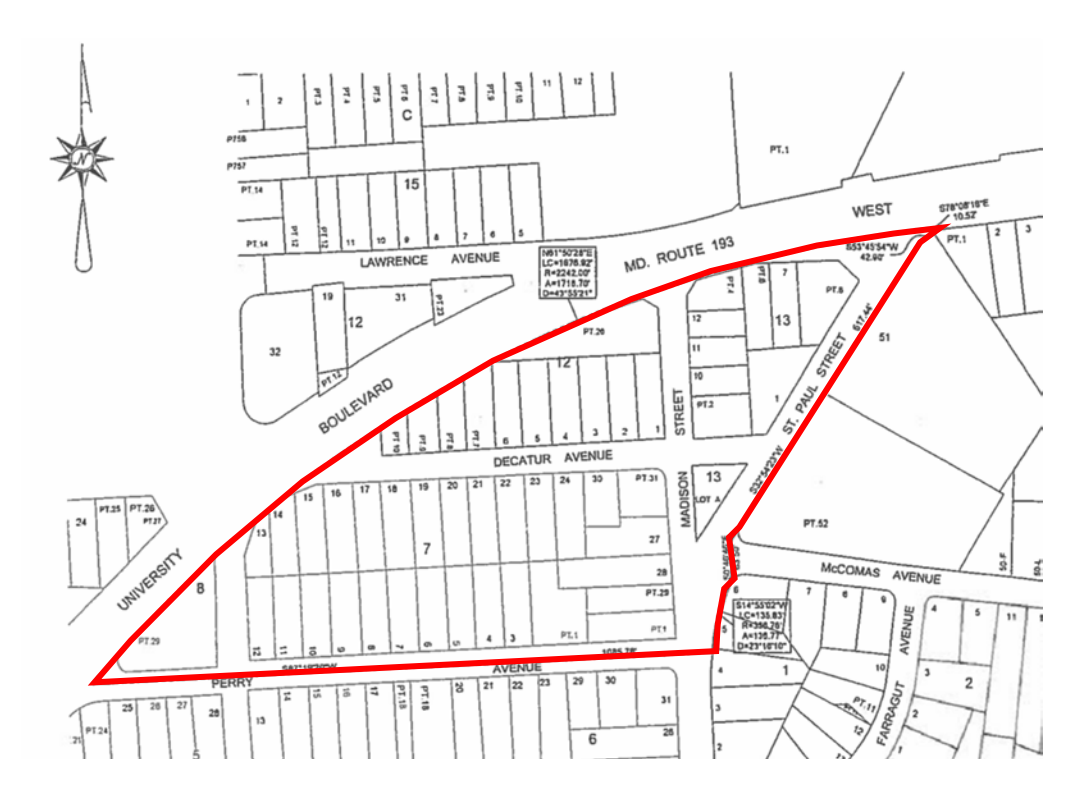
Figure 1: Town of Kensington proposed annexation area.

The Town of Kensington hosted a public hearing on August 13, 2018 and the Town Council is tentatively scheduled to act on the annexation petition on September 10, 2018.