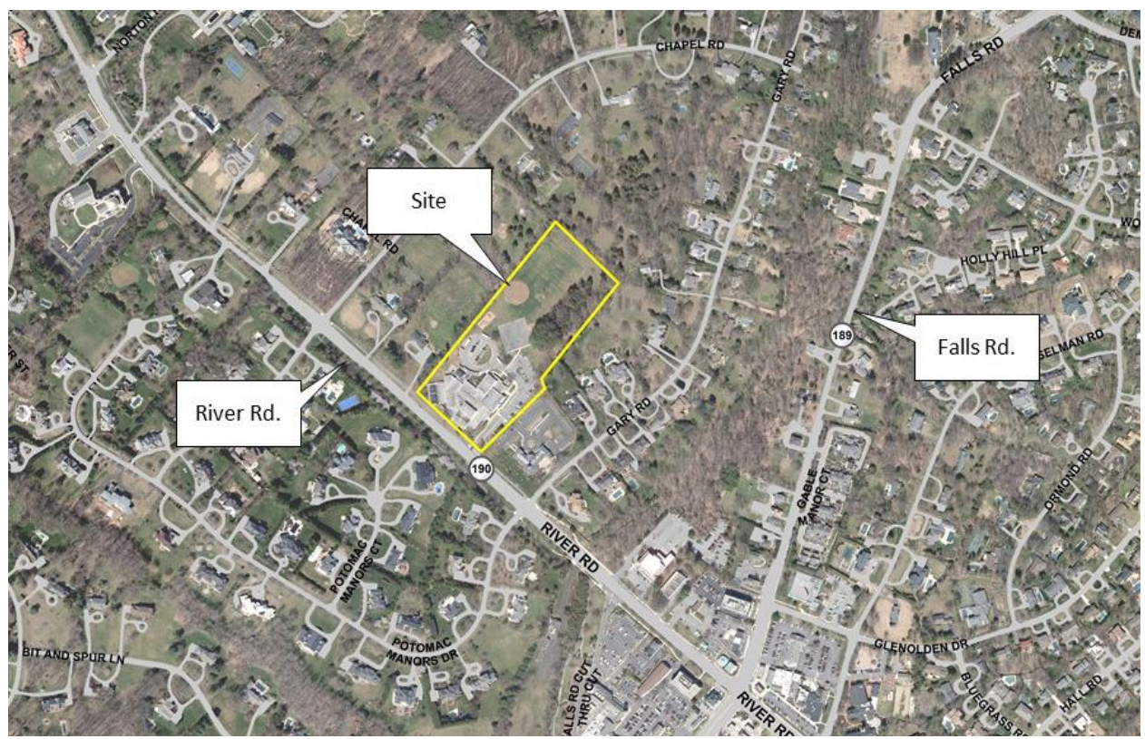
Figure 1: Aerial Photograph of Vicinity

The Potomac Elementary School Site consists of 9.64 acres, Parcel 937, at 10311 River Road, Potomac ("Site"), zoned RE-2. The Site is generally flat with the low spot located in the middle of the Site. The Site contains some individual trees, a wooded area in the northeast corner, Stream Valley Buffer (SVB), and 100-year floodplain. The neighboring properties are mostly residential except for a religious institution to the southeast. The Site is bounded on the south by River Road. The Site is within the boundaries of the 2002 Potomac Subregion Master Plan and is part of the Potomac area of the Subregion.