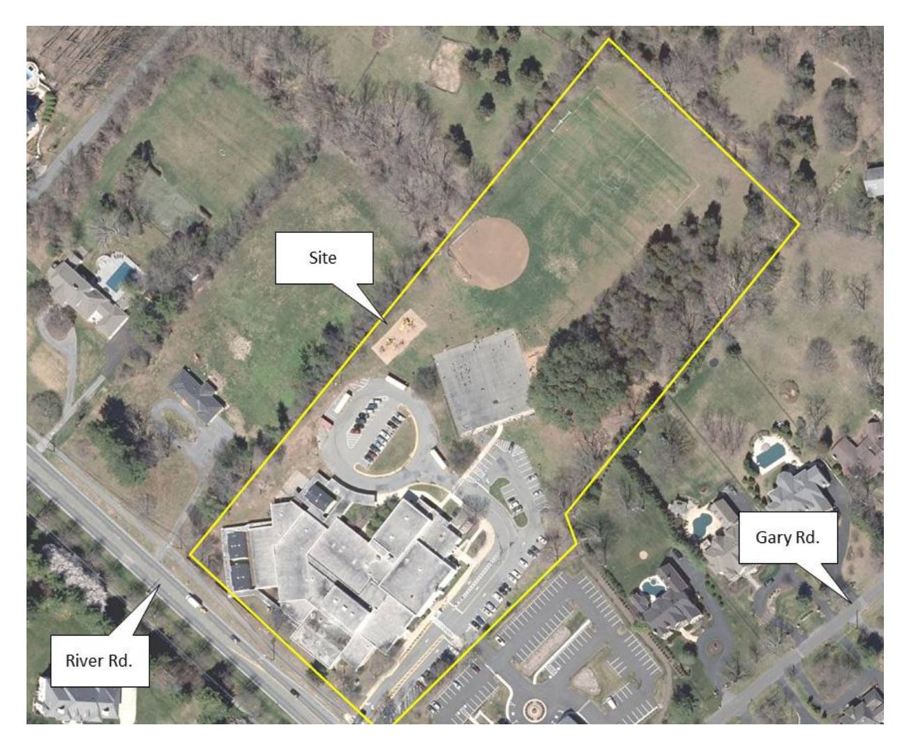
Figure 2: Aerial Photograph of the Site