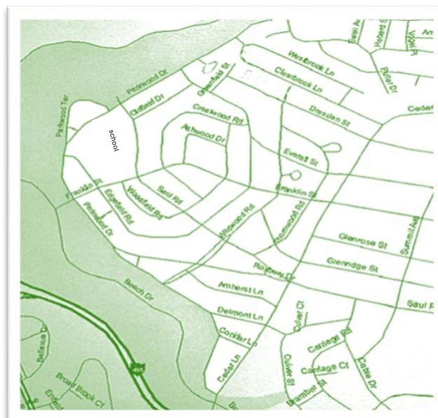
Map of Parkwood

For all of the reasons cited above, the Parkwood Residents Association, on behalf of the residents of the Parkwood community, requests that Planning Board agree to keep Beach Drive closed to vehicles on Saturdays, Sundays, and holidays, but open it to vehicles on Fridays.