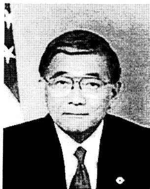
U.S. Transportation Secretary Norman Y. Mineta

Transportation is essential to America's security, economic prosperity and quality of life. Our surface transportation system has supported the Nation's strong economic performance, and the evolution of world commerce. The Transportation Equity Act for the 21st Century (TEA-21) provided record levels of investment to improve the safety and performance of our surface transportation system.