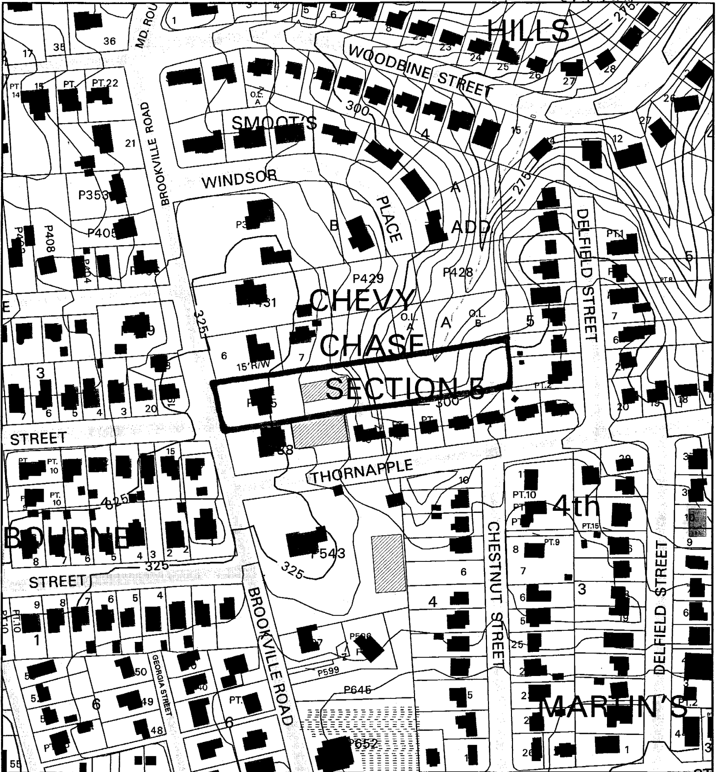
Map compiled on March 15, 2005 at 9:47 AM | Site located on base sheet no - 209NW03