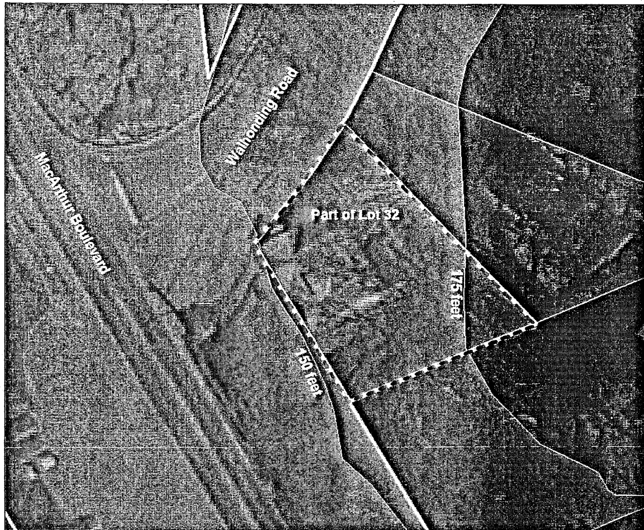
Figure 1. Subject Property with Topography

The existing detached garage will be demolished to allow space for gravel parking facility and a van accessible parking space with access to Walhonding Road. The proposed amount of parking (7 spaces) is in compliance with Section 59-E-3.7, which requires 2.5 parking spaces for each 1000 square feet of gross floor area for office uses. The van-accessible space will provide access to a flagstone sidewalk that leads to an entrance at the northeast side of the building. Signage is proposed for the van-accessible parking space.