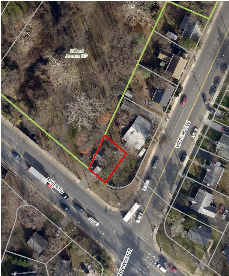
Figure 2: Sunninghorse River LLC Property adjacent to Willard Avenue Neighborhood Park