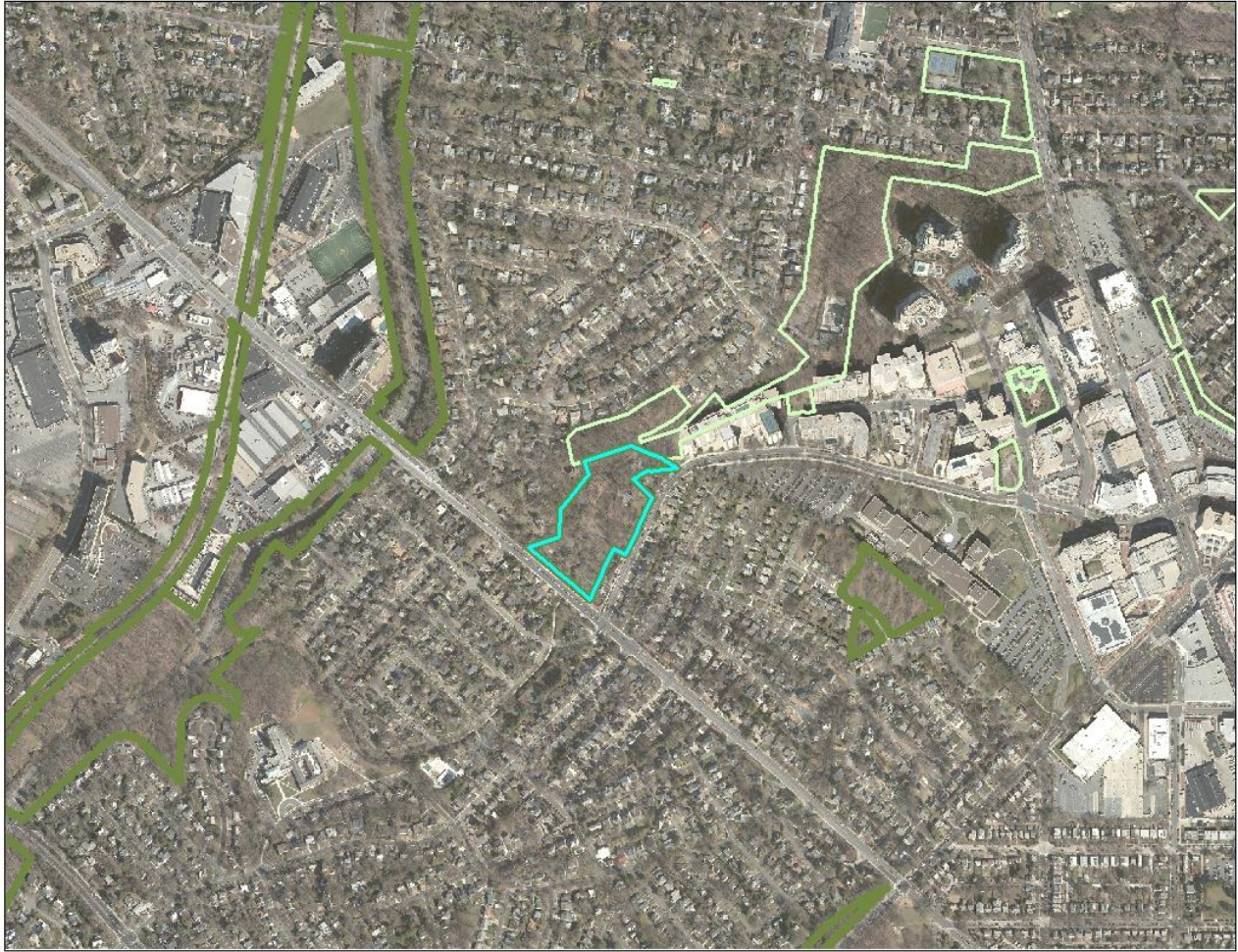
Figure 1: Willard Avenue Neighborhood Park location between Westbard and Friendship Heights