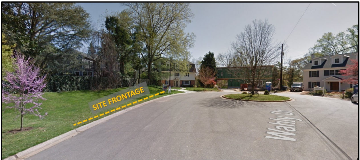
Figure 4 – View of Property from Wahly Drive