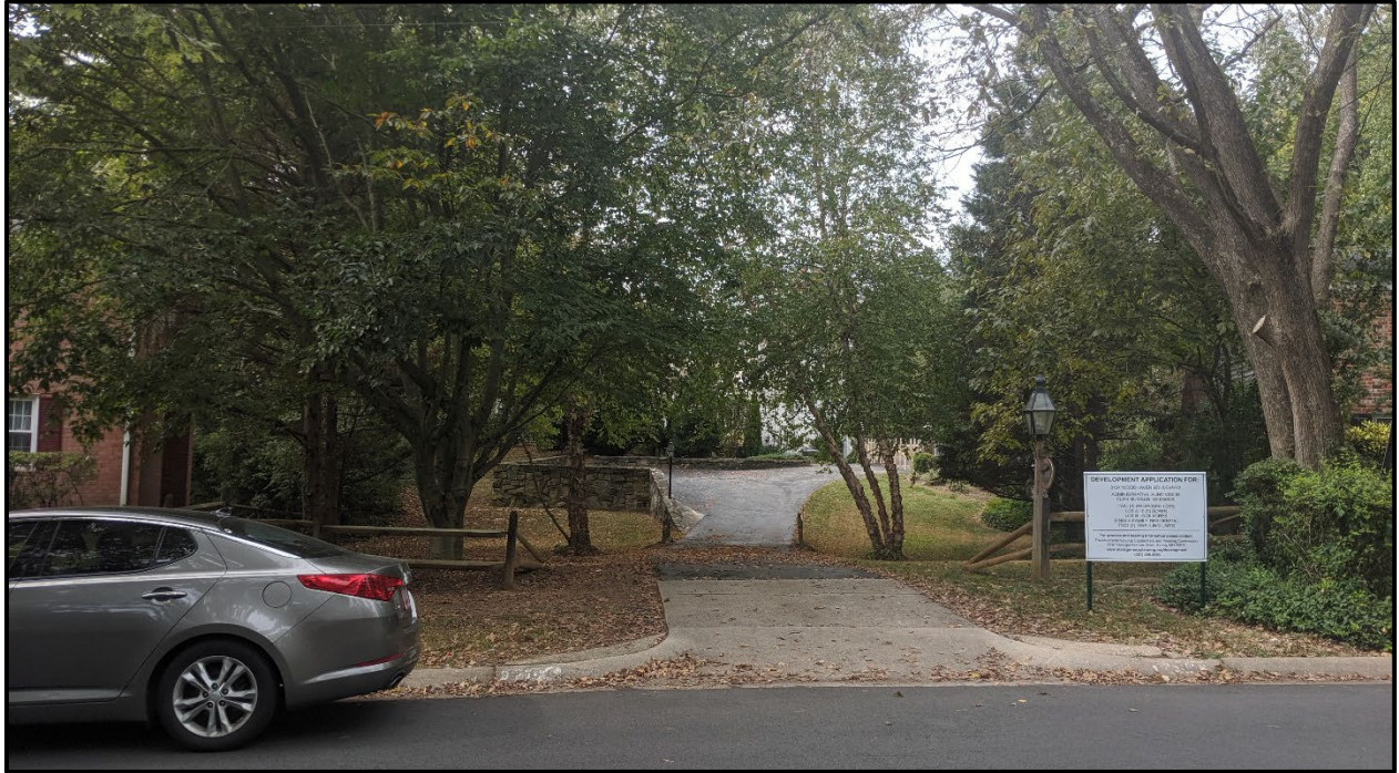
Figure 3 – View of Property from Woodhaven Boulevard

As depicted in Figure 2, the Property is currently developed with a single-family house and driveway with access from Woodhaven Boulevard. The Property lies within the Cabin John Creek Watershed and does not contain any forested areas. There are no other environmental features on or adjacent to the Property. There are no rare, threatened, or endangered species within the boundaries of the proposed project.