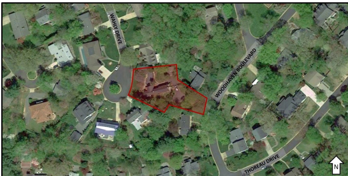
Figure 2 – Aerial Map

The subject site (Subject Property, Property, or Project) consists of Lot 10, Block A created in 1960 by Plat No. 5949 “West Bethesda Park.” The Subject Property is located on Woodhaven Boulevard approximately 200 feet north of Thoreau Drive, with frontage also on Wahly Drive. The Property consists of 21,505 square feet (0.49 acres), zoned R-90 and is within the 1990 Bethesda Chevy Chase Master Plan .