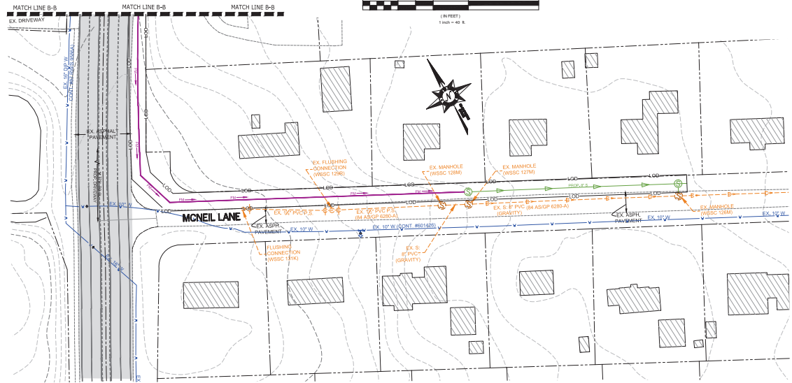
2 SITE PLAN Scale: 1" = 40'

NOTE: UNDERGROUND GARAGE PARKING TO BE BUILT AS PART OF PHASE I