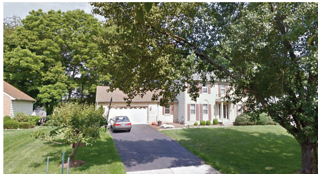
Examples of recessed garages in the nearby neighborhood