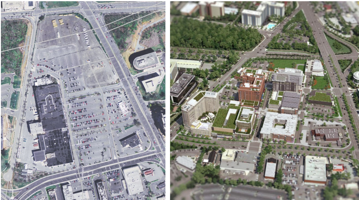
Figure 3: Improved Environmental Performance of Infill Development in the Pike District

Compact growth also improves the environmental performance of both sites and buildings, as it allows the redevelopment of areas developed prior to the adoption of modern stormwater controls and often characterized by high proportions of impervious surface cover. A compact form of infill development or redevelopment can reduce stormwater runoff and heat island effect using green infrastructure, green roofs and other green cover as well as building design and orientation to reduce urban temperatures.