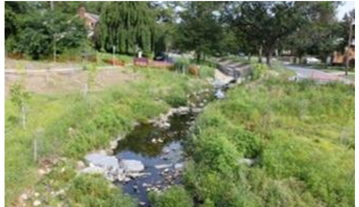
Figure 15. Evans Parkway after stream naturalization

natural terrain, reduces human-wildlife conflict and improves overall ecosystem performance. These benefits to the natural environment are especially important in parts of the county that have not been the beneficiaries of high levels of public and private investment.