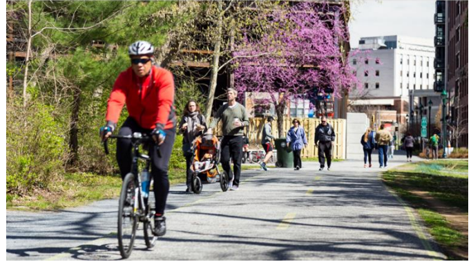
Figure 10. Trails are one of the most popular facilities in parks. They provide transportation, recreation, and opportunities for social gathering