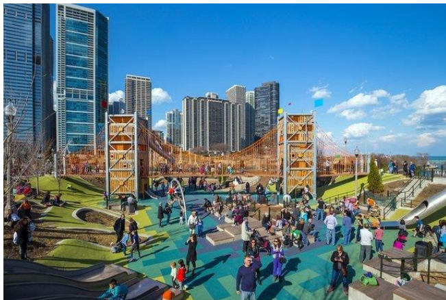
Figure 3. Maggie Daley Park, Chicago, IL

Over the coming decades, our challenge is to acquire, develop and program parks, recreation, and privately owned public spaces that provide a range of active recreation and community building opportunities throughout the most intensively developed parts of the county while continuing to apply sound environmental stewardship practices to public lands.