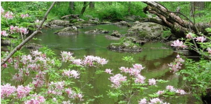
Figure 11. North Germantown Greenway Stream Valley Park

improve water quality, increase tree cover, enhance wildlife corridors, curb invasive species, and achieve other environmental goals.