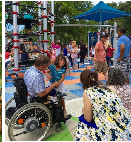
Figure 9. Wheaton Local Park. Accessibility is an important characteristic of a well-designed park.