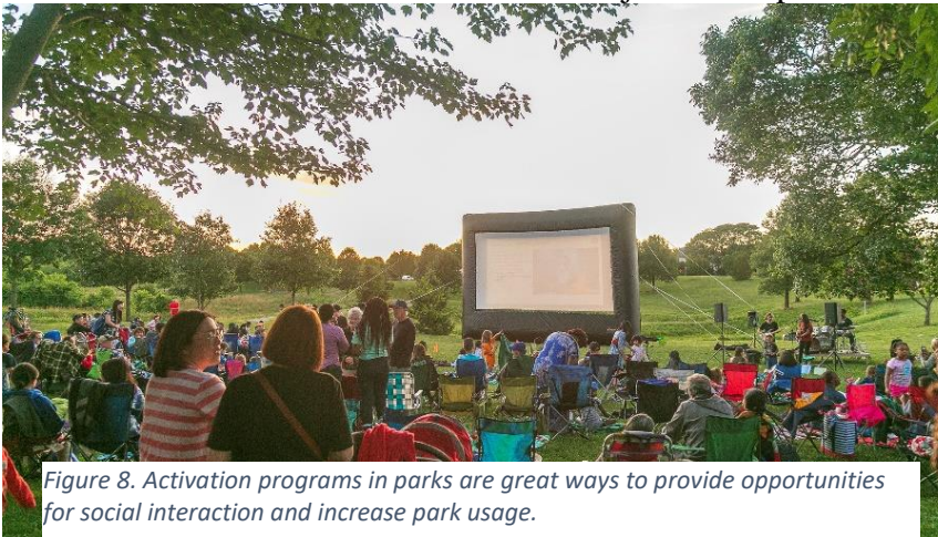
Figure 8. Activation programs in parks are great ways to provide opportunities for social interaction and increase park usage.