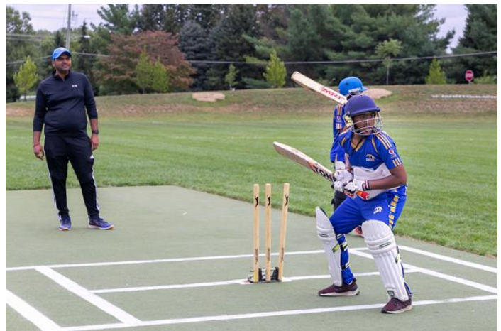
Figure 13. Montgomery County has increasing racial and ethnic diversity, with a projected growth in minority groups from 55 percent of the population in 2015 to 68 percent of the population in 2040. This diversity creates demands for different types of sports and recreation such as Cricket.

The quality and accessibility of urban parks is a basic component of equity in the delivery of public services. Parks are so integral to what makes a community desirable and healthy that ensuring equity in decisions about which land is acquired for parks in what part of the county and how that land is used is essential to achieving our goals for racial and socioeconomic justice. The Parks Department has made major strides in recent years in incorporating quantitative measures of equity in its capital budget recommendations, and this approach should be expanded to include analysis of programs and facilities run by other agencies, such as Montgomery County Public Schools, the Department of Recreation, and the Department of Libraries.