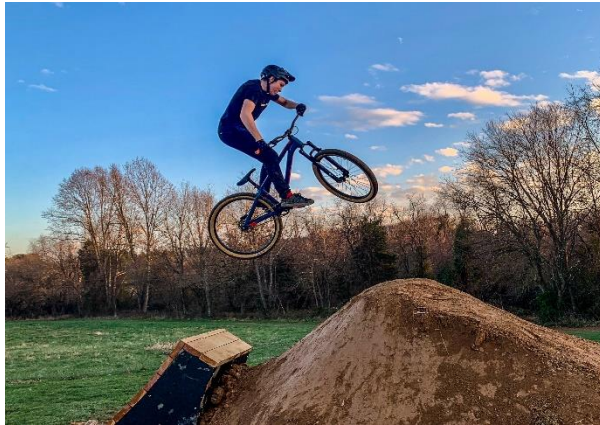
Figure 5. CDC data from 2019 indicates that only 14.6 - 20.5% of Maryland adolescents (grades 9-12) achieve 1hr or more of moderate and/or vigorous physical activity daily