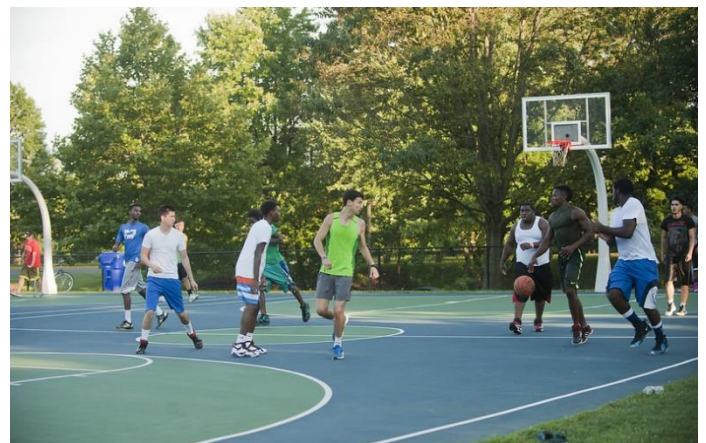
Figure 16. According to the CDC, inactivity contributes to 1 in 10 premature deaths in the U.S. Inadequate levels of physical activity are associated with $117 billion in annual healthcare costs.

Likewise, community gardens help to reduce the impact of food deserts in low-income areas,