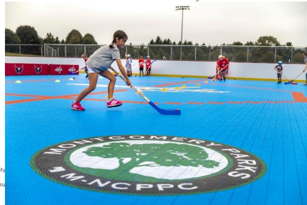
Figure 6. Recent survey data show that the percentage of children under age 12 who played team sports "regularly" has declined in recent years, from 42% in 2011 to 38% in 2018.