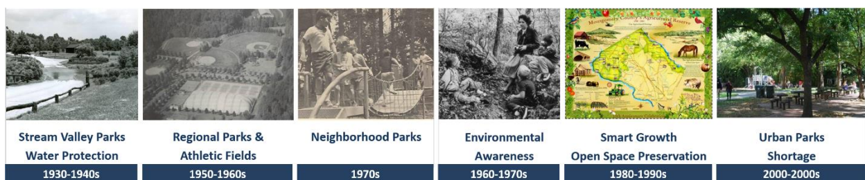
Figure 1. Montgomery County Timeline 1930s to 2010s

The Parks Department has built a well-deserved reputation for environmental stewardship, and it has made progress in providing a wider range of recreational opportunities, such as cricket, to meet the needs of a more culturally diverse population. It has room, however, for improvement: