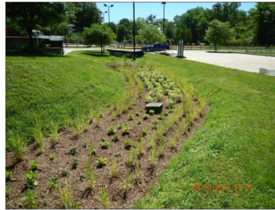
Figure 2. Bioretention Facility

Meanwhile, the role of land conservation and stewardship in addressing the county's environmental sustainability goals is as important as ever. Urban redevelopment and infill will reduce the environmental impact of future growth by reducing greenhouse gas emissions and help reverse the damage from earlier development by incorporating modern state-of-the-practice stormwater management features. Nonetheless, the environmental performance of green infrastructure on public land must keep getting better to improve water quality, limit property damage and erosion from flooding, and add tree and forest cover.