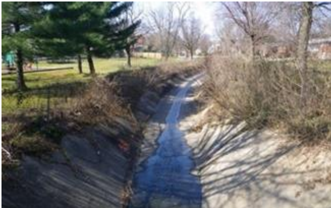
Figure 14. Evans Parkway before stream naturalization

Of course, parks also play a major role in environmental sustainability. Climate change has resulted in increased frequency, intensity and/or duration of fires, flooding/rain events, drought, wind events, and extreme temperatures. This rapid destabilization of climate patterns jeopardizes the ecological stability of nearly all global communities. Parks and natural areas help address the effects of climate change and enhance environmental resiliency . Stream restoration and stormwater management projects on parkland protect against flooding and improve water quality. Parks provide wildlife corridors that can account for changes in habitat patterns. Urban tree canopy mitigates thermal pollution, helps limit the heat island effect of intensive development, filters pollutants, and sequesters carbon. Habitat restoration provides wildlife with