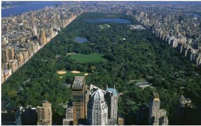
Figure 12. Surrounding Central Park is some of the most expensive real estate on the planet.

World-class places require world-class park, recreation and cultural amenities. Look to Central Park in New York, Golden Gate Park in San Francisco, Millennial Millennium Park in Chicago, or Hyde Park in London and the significance of great urban parks becomes clear. Parks are essential to creating vibrant, economically competitive places. In fact, parks and the amenities they provide are regularly cited as among the most important factors influencing decisions by businesses about where to relocate or expand.