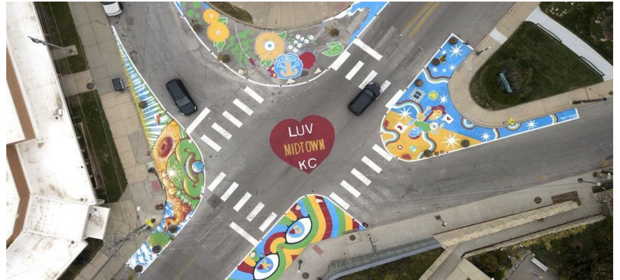
Curb Extensions to Straighten a Challenging Intersection