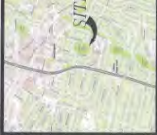
VICINITY MAP SCALE: 1" = 1500'