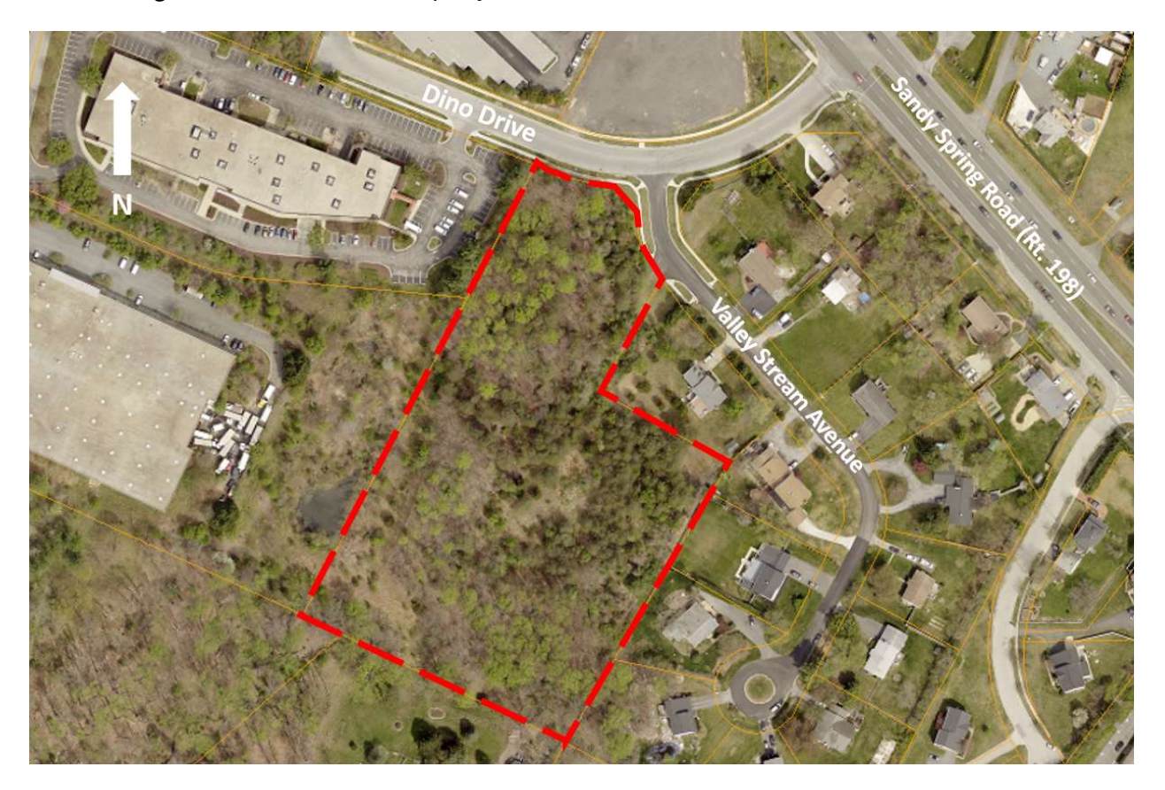
Figure 2 – Subject Property

The Property is currently unimproved and mostly forested. The Property slopes from the higher point closer to Dino Drive and Valley Stream Avenue, downhill towards the rear or south end of the Property. The Property contains a stream, small wetland, and a stream valley buffer in the southwest corner along the rear lot line. The Property is zoned R-200.