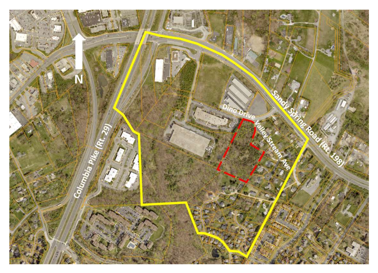
Figure 1: Vicinity Map with Staff-defined neighborhood highlighted in solid yellow.

As delineated in the solid yellow line in Figure 1 below, Staff defined a neighborhood for purposes of analyzing this Conditional Use and its possible impacts on the character of the surrounding area. Staff determined the neighborhood based on properties that would be most impacted by the Conditional Use. The neighborhood as defined is comprised of moderate-density residential development and commercial uses such as offices, retail, self-storage, and warehousing uses. Staff did not find any active Conditional Uses/Special Exceptions in the defined neighborhood. The properties to the northeast, east and south are all zoned R-200 and are comprised of moderate-residential density uses. The property to the southwest of the Subject Property is Fairland Recreational Park. The properties to the north are zoned EOF and are comprised of office and warehousing uses. The properties to the north