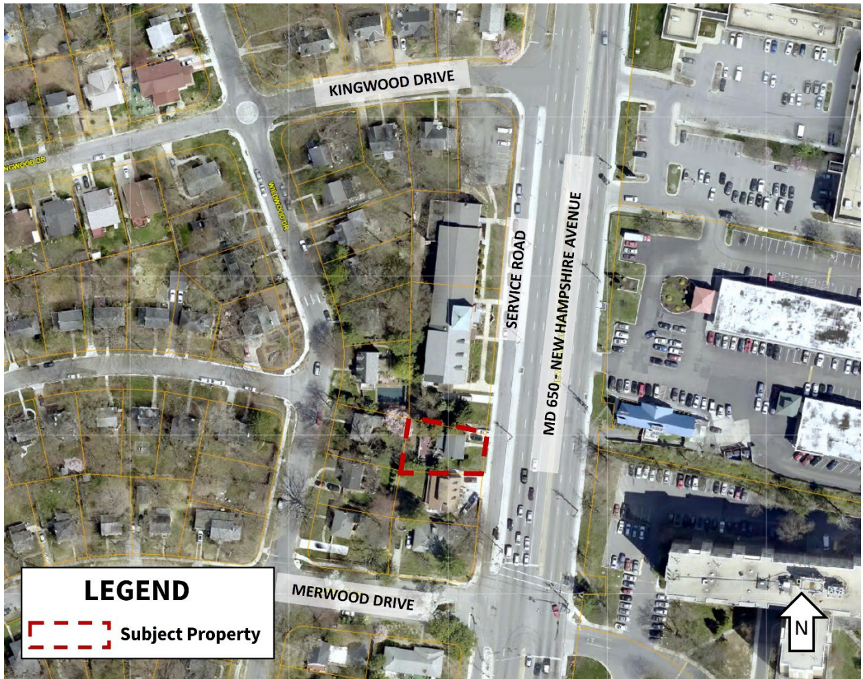
Figure 2 - Subject Property