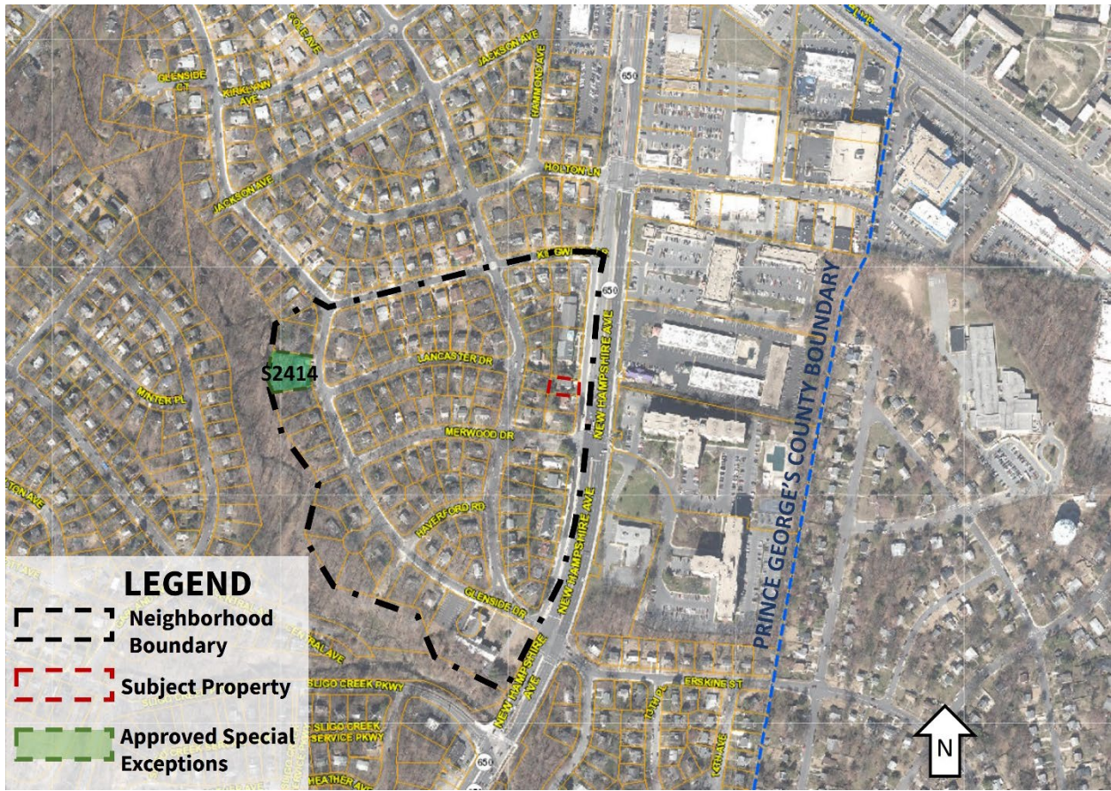
Figure 1: Vicinity Map with Staff-defined neighborhood highlighted in black

Staff identified one existing, approved special exception within the defined neighborhood, S2414 shown in Figure 1 above at the western boundary, which was approved in 2002 to allow for an accessory apartment.