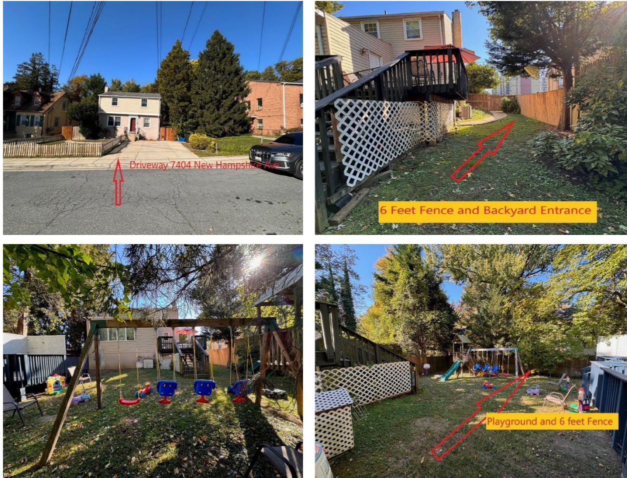
Figure 3 – View of Property from service road

The Site contains no streams or stream buffers, wetlands or wetland buffers, 100-year floodplains, hydraulically-adjacent steep slopes, or known occurrences of Rare, Threatened and Endangered species. The Site is in the Sligo Creek watershed, which is a Use I 1 watershed. The Site is not within a Special Protection Area.