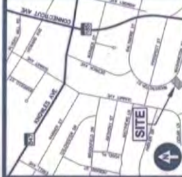
VICINITY MAP SCALE: 1" = 200'