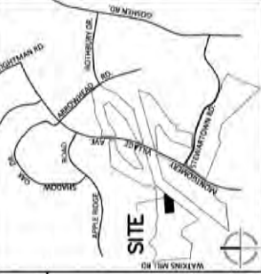
VICINITY MAP SCALE: 1" = 2000'