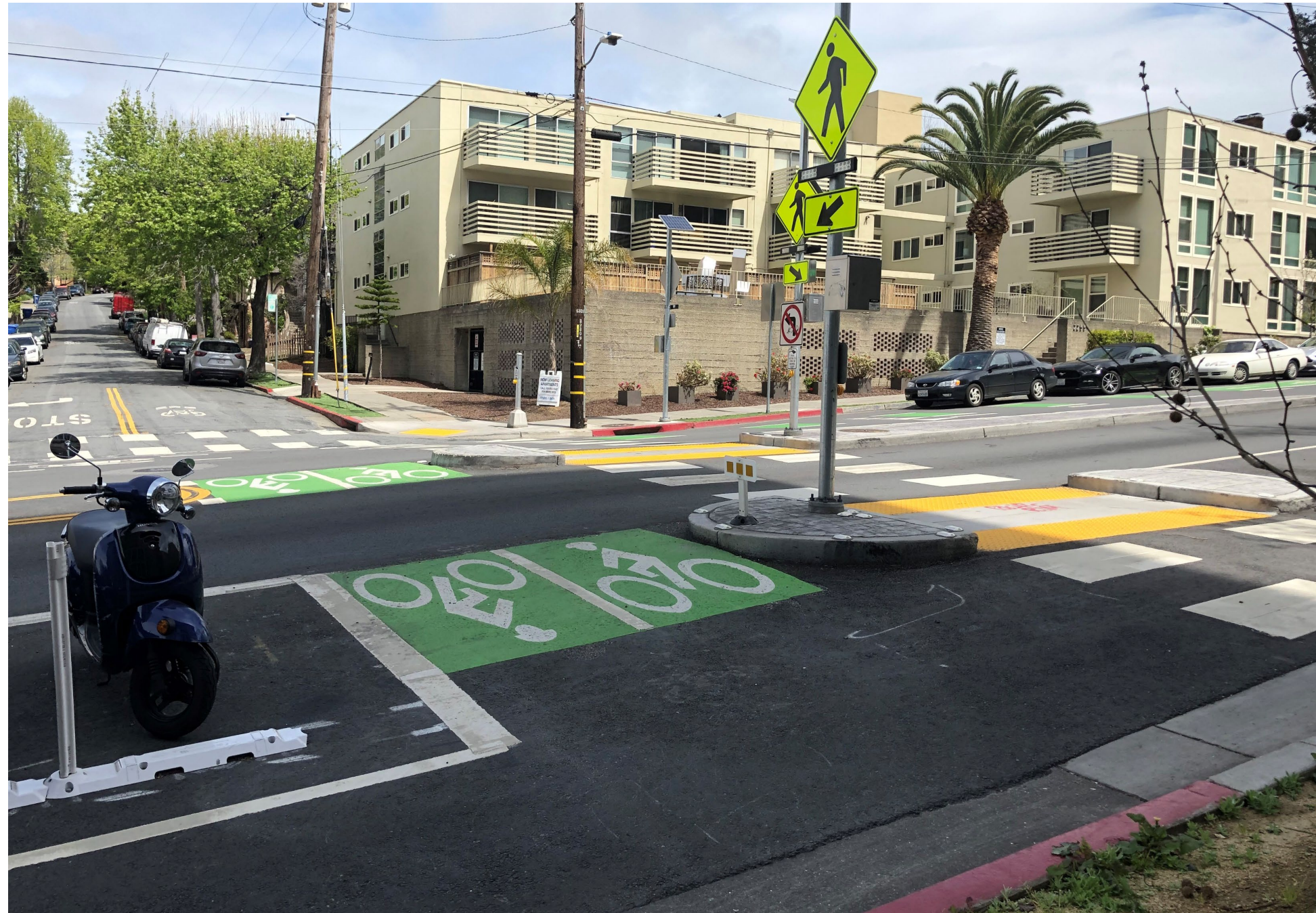
Pedestrian Hybrid Beacons