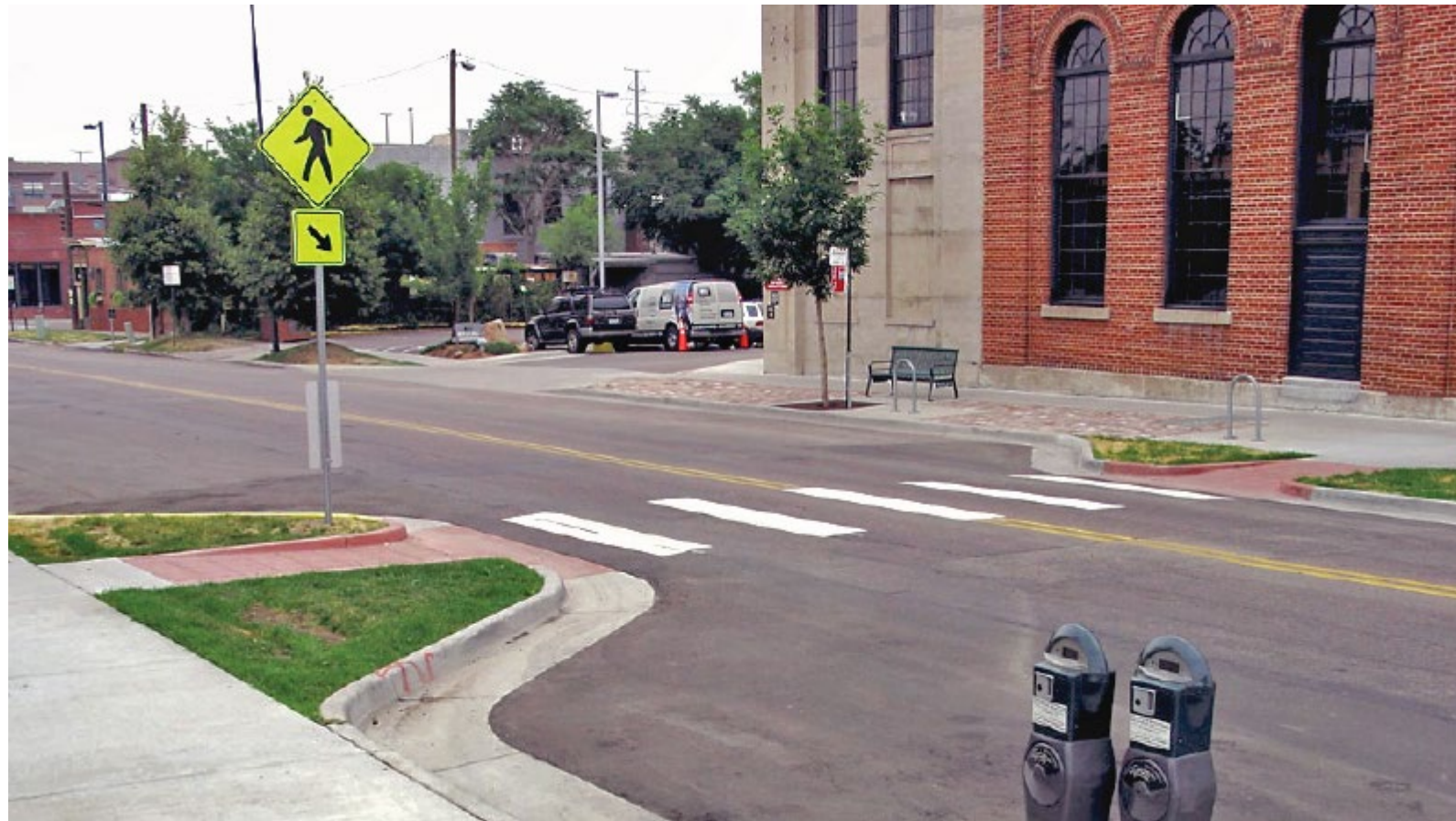
Curb Extension at Mid-Block Crossing