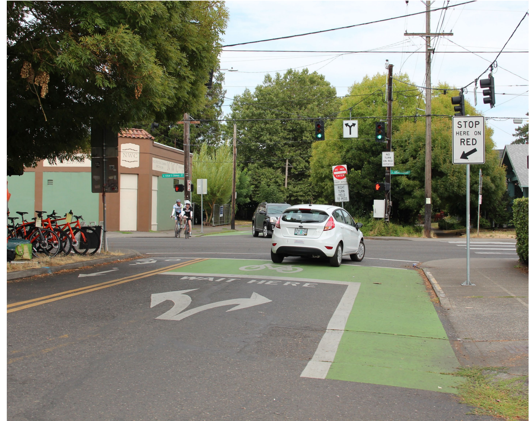
Bike Boxes with Lead-In Bike Lanes