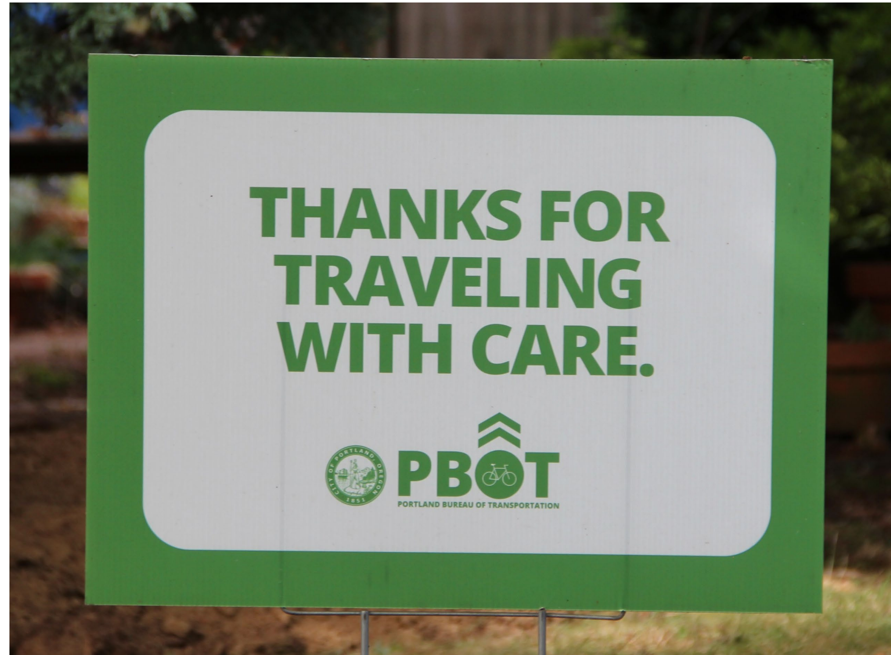
Branded Signage for Reinforcement