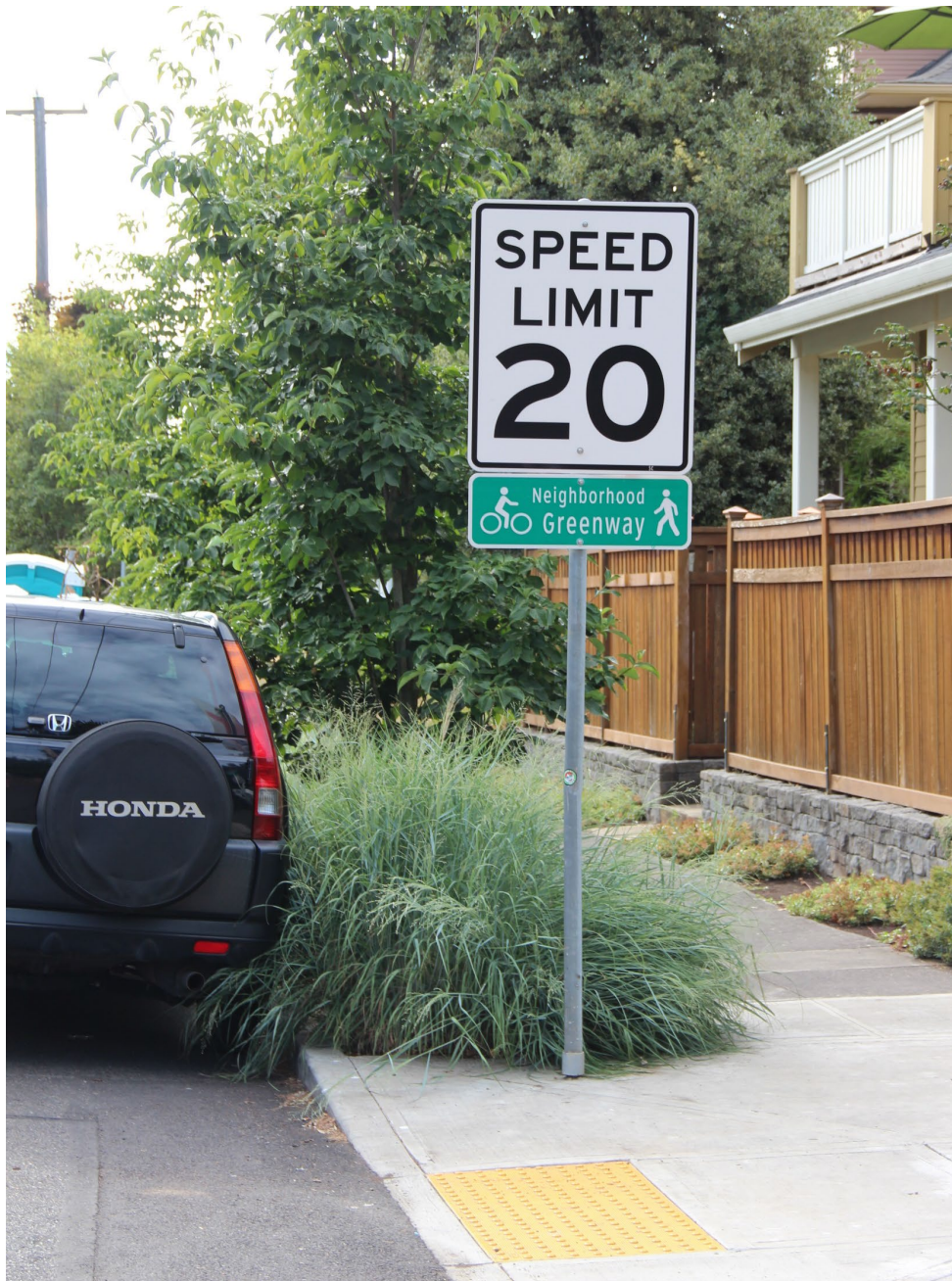
Lower Posted Speed Limits