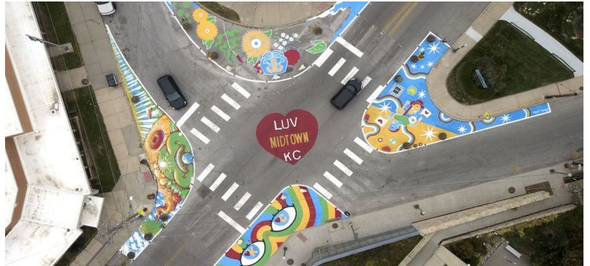
Curb Extensions to Straighten a Challenging Intersection