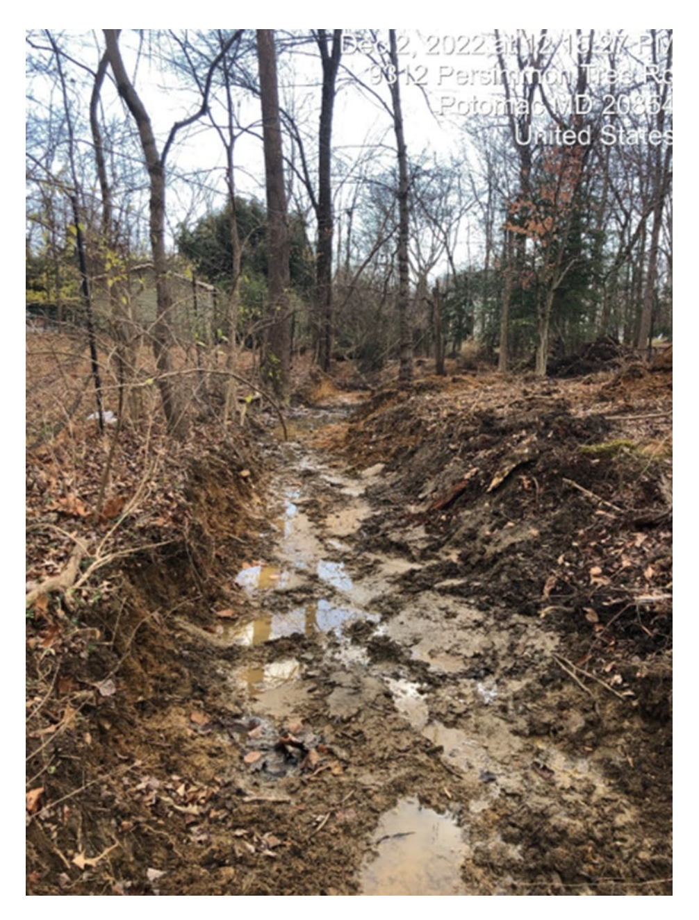
Figure 1. DPS Photo During Pipe Installation