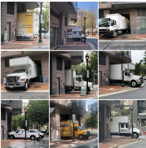
ZOM / Maizon