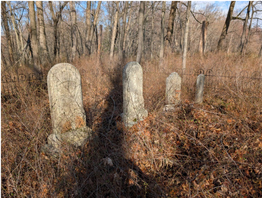
Figure 1: Hawlings River Chapel of Ease Cemetery